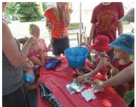
Kids and their families participate in a fun financial education activity at Family Fun Day in downtown Lapeer. Once LEAF launched, deposit days, community financial education workshops to support parents and families and more continued to keep the idea of savings forefront in each student’s mind.