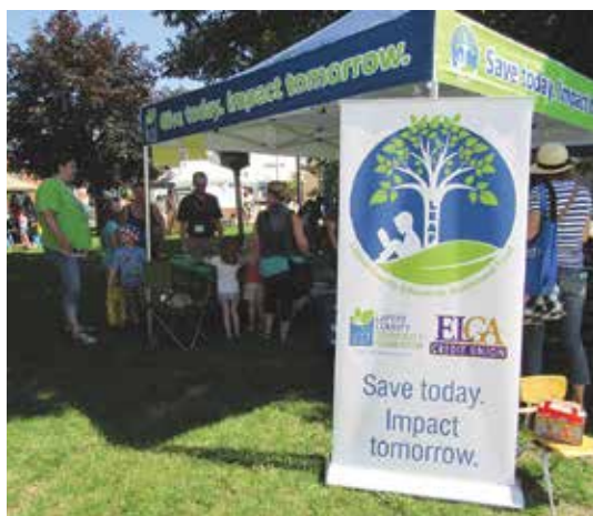
LCCF attended Family Fun Day in downtown Lapeer to introduce the Lapeer County community to the LEAF program, a child savings account that is started with $25 of seed money from LCCF for each kindergarten student in Lapeer County. Students are able to earn additional incentives to help grow their accounts.