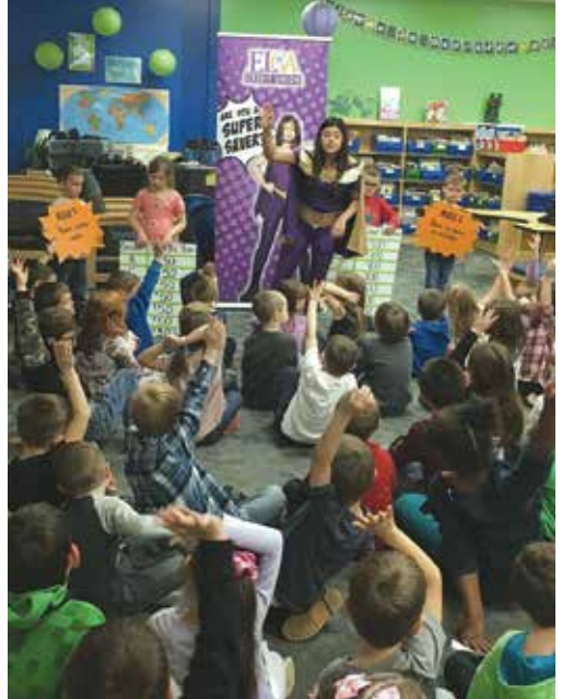
The LEAF financial partner, ELGA Credit Union, provides financial literacy curriculum and lessons to kindergarten students in Lapeer County which talks about their newly-opened LEAF accounts and the importance of saving money for their future.

The LCCF is actively working with our community partners, donors, and local organizations to fully endow the LEAF Fund so that every student and family in Lapeer County, forever, can be given the financial and academic tools to achieve their future goals – and build assets for future financial independence.