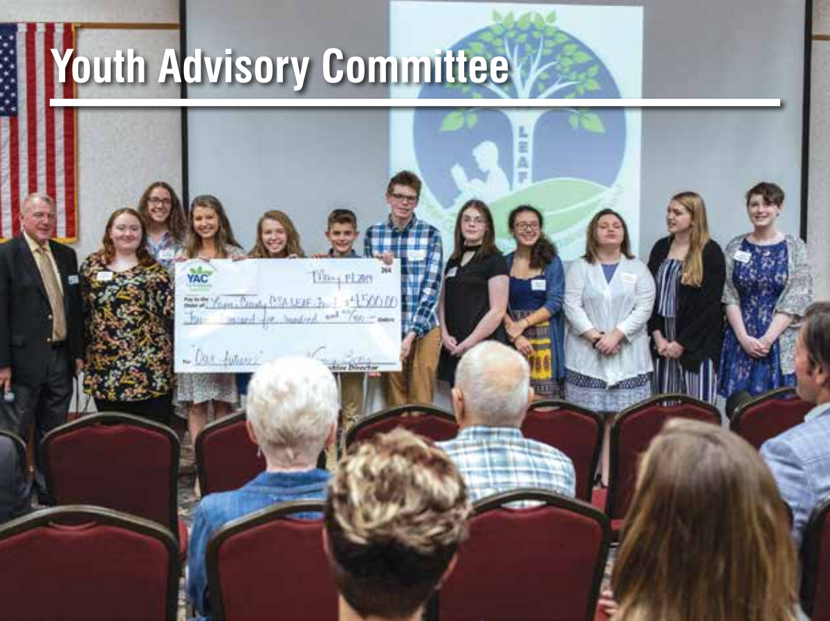
The YAC presented a check for the LEAF Fund at the Annual Celebration.