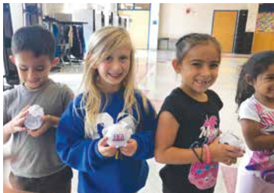
Nearly 900 kindergarten students were introduced to LEAF in the fall of 2019. Here students from Weston Elementary School in Imlay City learn more about the program and receive their piggy bank to help encourage saving.