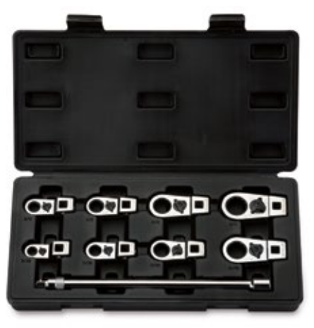
Part No. SN24001