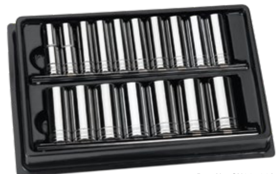
Part No. SN32501A