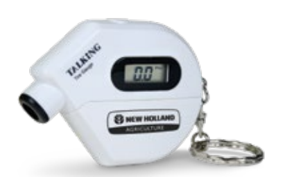
Part No. SN50080