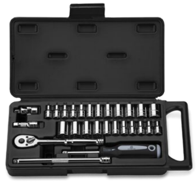
Part No. SN10001