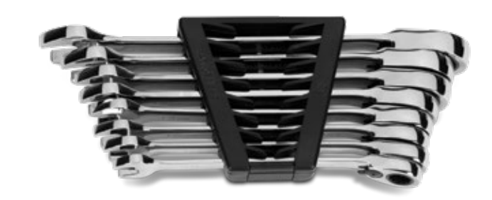
Part No. SN70501