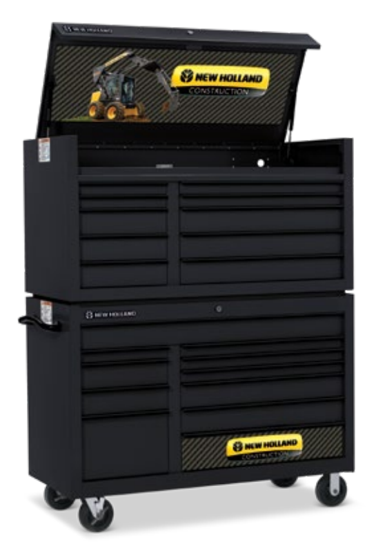
Part No. SN5000NC