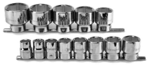
Part No. SN40501