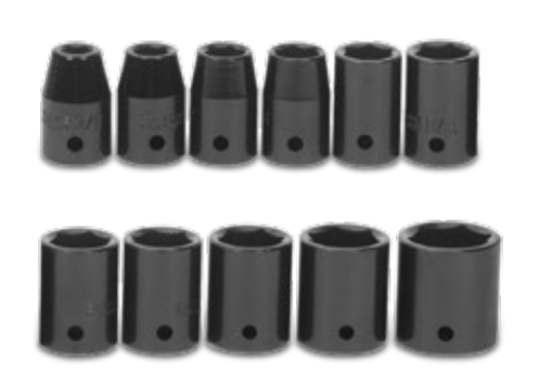
Part No. SN31001