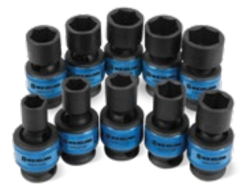
Part No. SN26501