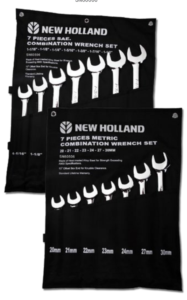
Part No. SN60506