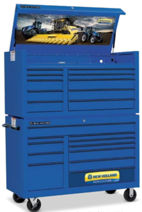
Part No. SN5000NA