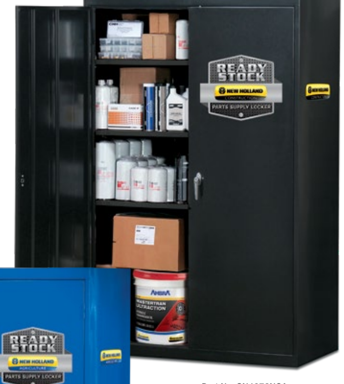
Part No. SN4672NCA