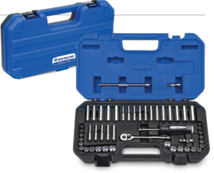
Part No. SN10002A