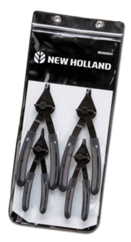
Part No. SN90004