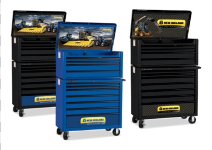
See page 40 for more information on SN4000 storage units.