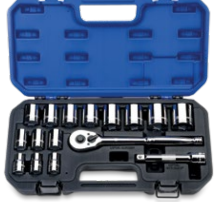
Part No. SN30001AA