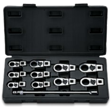
Part No. SN24501