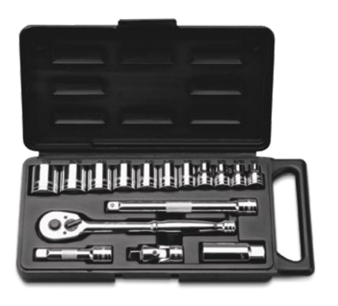
Part No. SN20001A