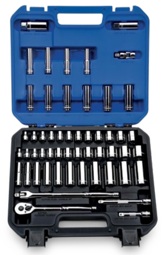
Part No. SN20002A