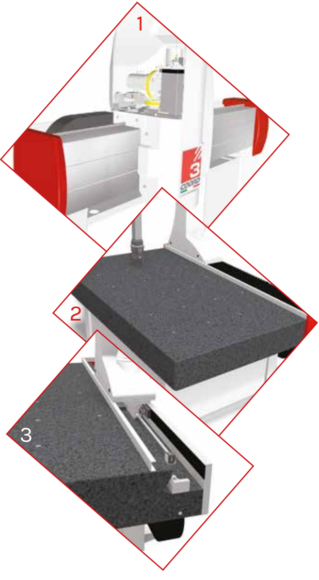
1. ZERO-HYSTERESIS FRICTION DRIVES ON ALL AXES

The ARES NT model has a silicon carbide Z-axis column that increases the overall stiffness of the measuring platform.