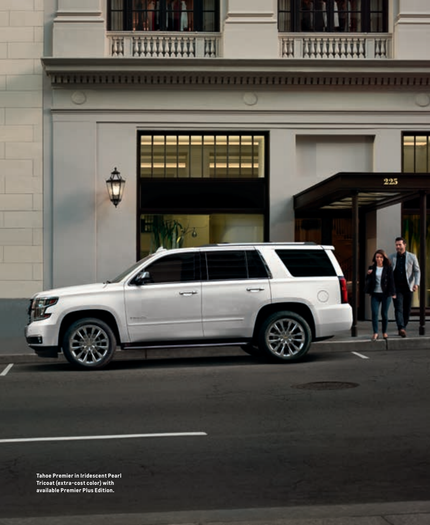
Tahoe Premier in Iridescent Pearl Tricoat (extra-cost color) with available Premier Plus Edition.