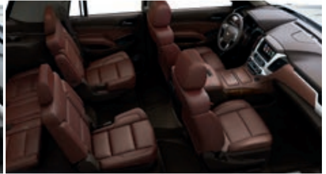
Mahogany Perforated Leather Appointments with Cocoa Accents 3,4