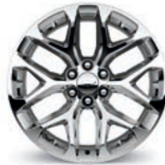
22" Chrome-Aluminum Multi-Featured Design (RPT) (Available on LT and Premier)