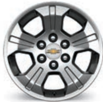
18" Painted-Aluminum (RCV) (Included with Custom Edition and Z71 Off-Road Package)