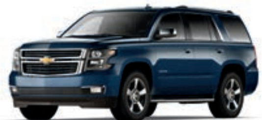
BLUE VELVET METALLIC