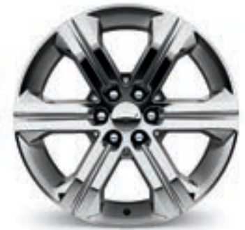
22" Chrome-Aluminum (SMI) (Available on LT and Premier)