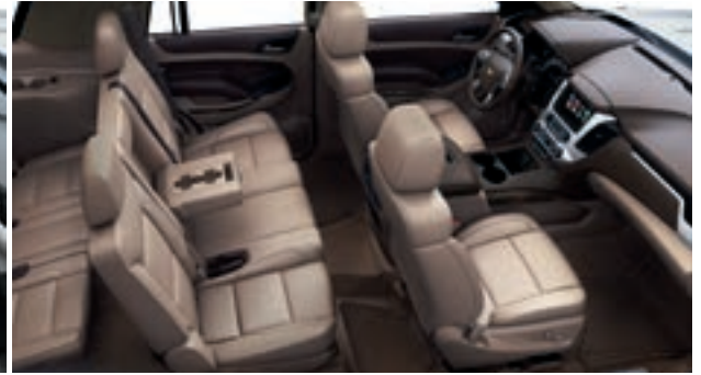
Dune Leather Appointments with Cocoa Accents 2