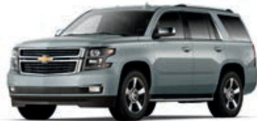
SATIN STEEL METALLIC