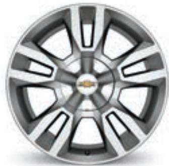
22" Bright Machined-Aluminum with Bright Silver Finish (SIY) (Available on Premier)