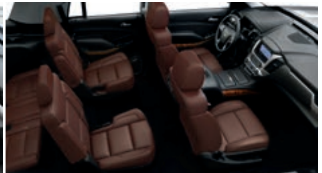
Mahogany Perforated Leather Appointments with Jet Black Accents 6