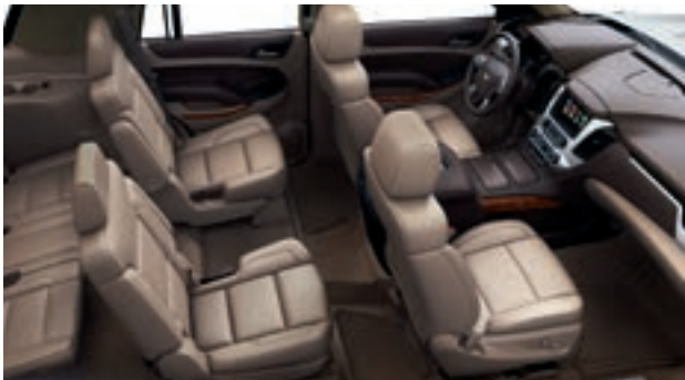
Dune Perforated Leather Appointments with Cocoa Accents 5