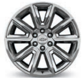
22" Premium Painted-Aluminum with Chrome Inserts (SGF) (Available on LT and Premier)