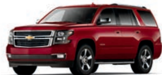
SIREN RED TINTCOAT 1