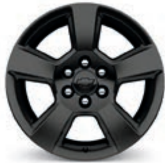
20" Black-Painted Aluminum (NZQ) (Included with LT Midnight Edition)