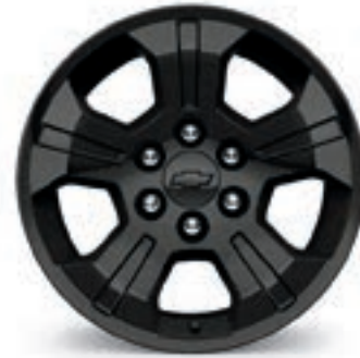
18" Black-Painted Aluminum (REG) (Included with Z71 Midnight Edition and Custom Midnight Edition)