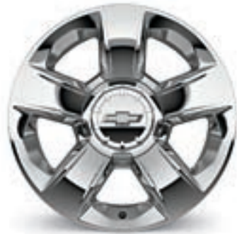
20" Chrome-Aluminum (RD2) (Available on Premier; included with LT Signature Package)