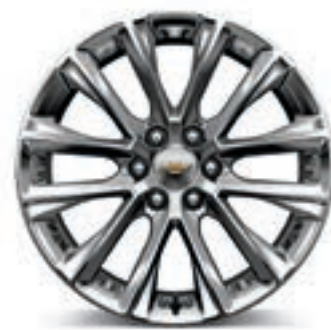
22" 12-Spoke Aluminum with Polished Finish (SH0) (Included with Premier Plus Edition)