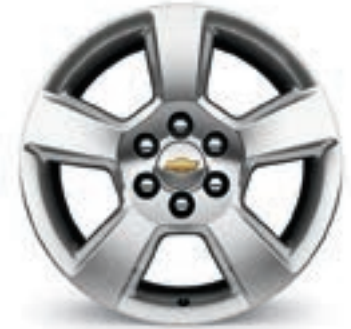
20" Polished-Aluminum (RD4) (Standard on Premier; available on LS and LT)