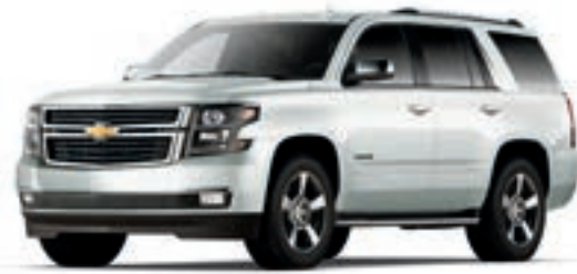
IRIDESCENT PEARL TRICOAT 1,2