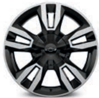
22" Gloss Black-Painted Aluminum with Custom Silver Accents (SGK) (Included with RST Edition)