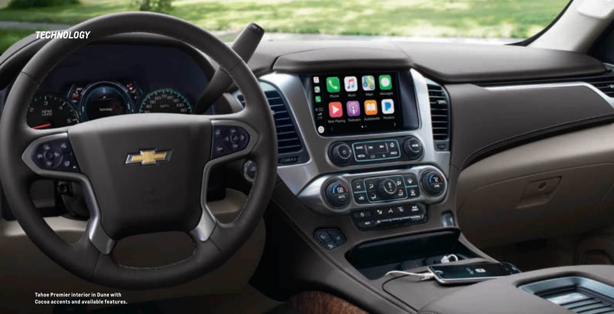
Tahoe Premier interior in Dune with Cocoa accents and available features.