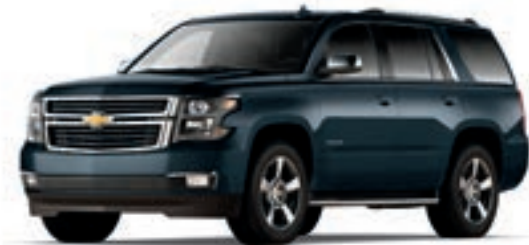
SHADOW GRAY METALLIC