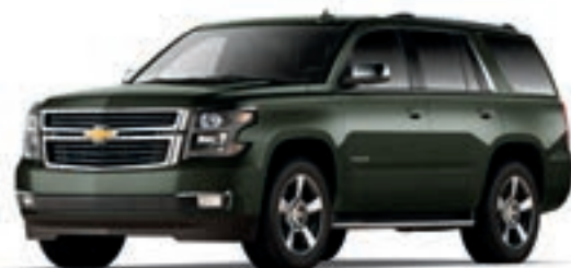
DEEPWOOD GREEN METALLIC 1,3