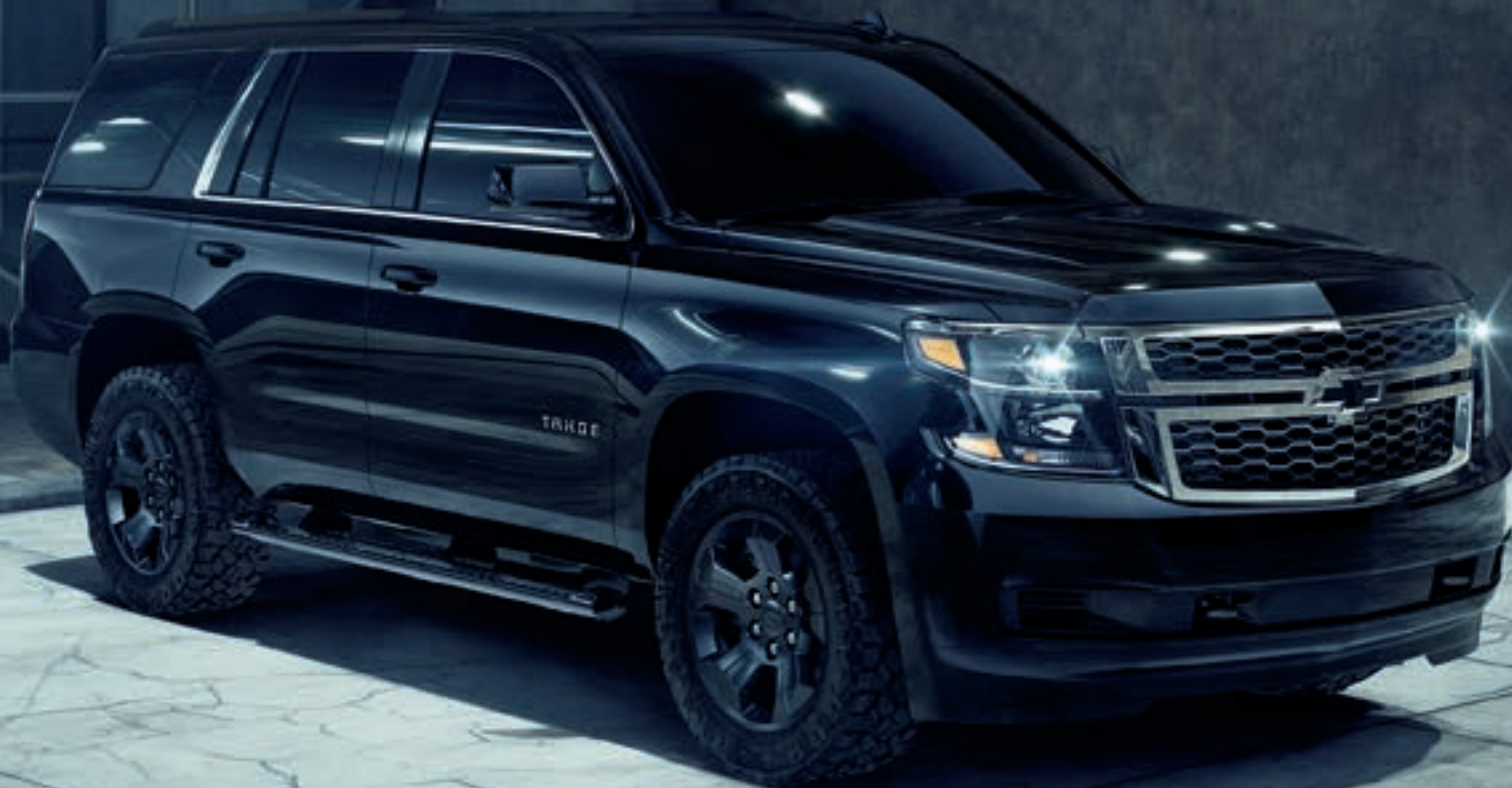
Tahoe LS in Black with available Custom Midnight Edition.