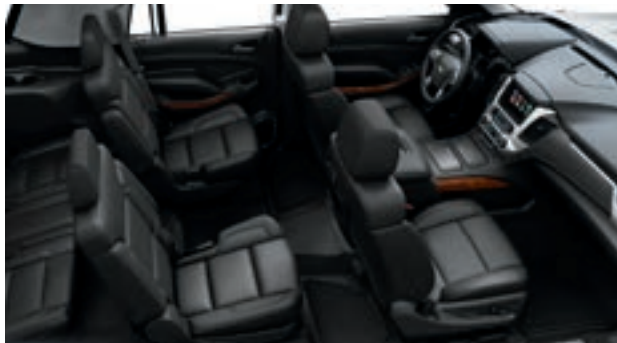
Jet Black Perforated Leather Appointments with Jet Black Accents 5