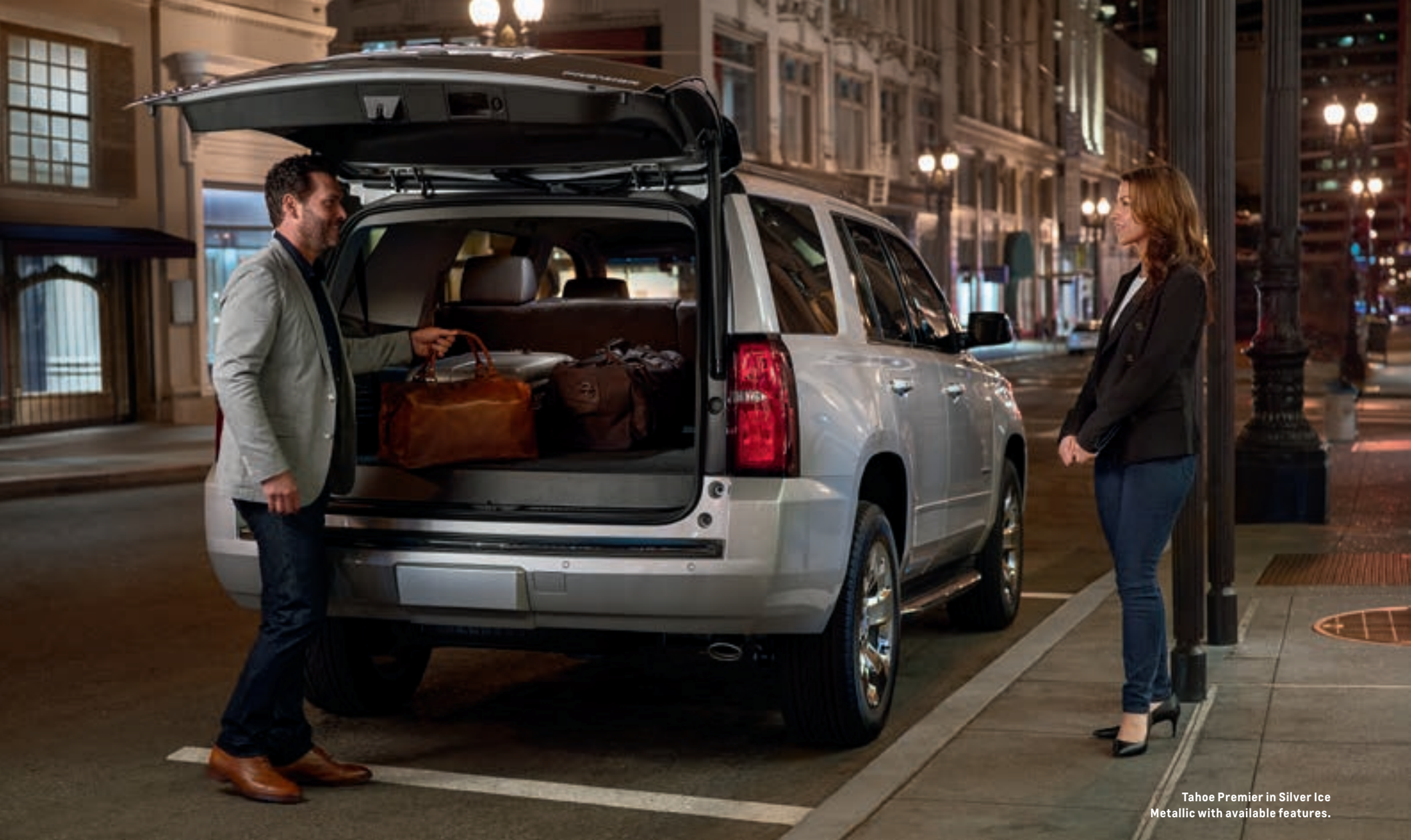
Tahoe Premier in Silver Ice Metallic with available features.

BE READY FOR ANYTHING. With the second- and third-row seats folded down, you'll have 94.7 cu. ft. of cargo space! That's more than enough room for everyday use or a weeklong road trip.