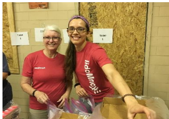
Beaumont employees assist with relief from Tropical Storm Imelda.

In 2019, 17,000 ExxonMobil employees, retirees and their families donated more than 443,000 volunteer hours to more than 3,700 charitable organizations in 28 countries through our volunteer programs.