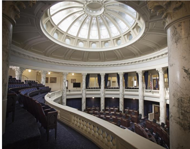
We support organizations that provide and promote sound policies and cross-cultural engagement.

We support organizations that foster international understanding and engagement, including the Council on Foreign Relations and the World Affairs Council. Our involvement with the Business Council for International Understanding, Corporate Council on Africa and similar organizations facilitates cross-cultural awareness and progress.