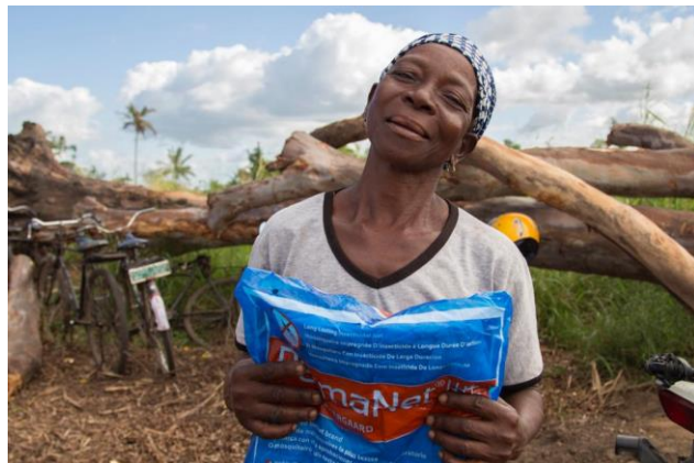
ExxonMobil has helped distribute more than 15 million bed nets since 2000.

In 2019, ExxonMobil's health and environmental contributions totaled $16.5 million, with $9.2 million benefiting communities outside of the United States. Our environmental investments focus on several important areas including conservation in a range of ecosystems, environmental education and outreach, and scientific research of environmental issues. These contributions are only a small portion of our company's overall investments in the environmental area; investments do not include the company's environmental capital and operating expenditures.