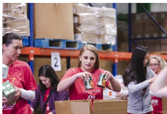
XTO employees volunteer at a food bank in the Permian Basin.

Employees and retirees in Canada pledged more than $1.1 million to the United Way, bringing the total corporate and employee donations in Canada to $1.7 million. In Dallas, ExxonMobil, its employees, and retirees donated almost $1.4 million through our Employees' Favorite Charities Campaign.