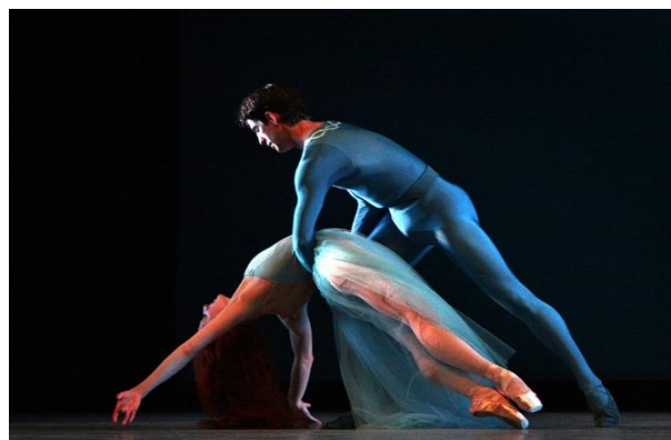
In 2019, employees and retirees donated nearly $3 million to arts and cultural organizations.

In the United States, funding for the arts is provided primarily through the ExxonMobil Foundation's matching gift programs. In 2019, employees and retirees donated more than $2.8 million to arts and cultural organizations, and the ExxonMobil Foundation contributed more than $1.9 million by matching their donations.