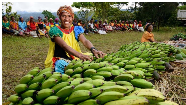
ExxonMobil supports programs to help women fulfill their economic potential and improve their well-being.

In 2019, contributions totaling almost $2.6 million were made to help advance economic opportunities for women. Empowering women is a key element in enhancing local and international economic development. Investing in women helps support broad transformation in developing regions and contributes to a more equitable society. For example, it helps to lower infant mortality, improve health and nutrition, increase educational opportunities, enhance economic growth and food security, and reduce poverty.