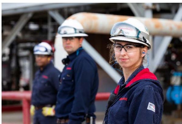
ExxonMobil supports workforce development programs to help recruit, train and develop workers for successful careers.

In Texas, for example, we supported the Lee College Community College Petrochemical Initiative and the Texas A&M Engineering Extension Service, a recognized leader in delivering emergency response and workforce training.