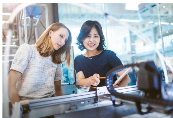
ExxonMobil granted more than $41 million to colleges, universities and other higher education organizations in 2019.

Our major financial support for higher education in the United States is through the ExxonMobil Foundation's Educational Matching Gift Program. In 2019, we granted $33.6 million in matching funds to 825 colleges and universities, the United Negro College Fund, the Hispanic Scholarship Fund and the American Indian College Fund.