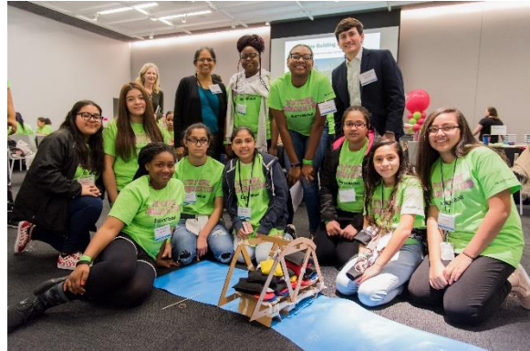
Participants at the ExxonMobil Introduce a Girl to Engineering Program in Dallas, Texas.

In 2019, we invested nearly $7 million in STEM-related programs in the United States. Outside the United States, we establish local partnerships with organizations that have close ties with a country's educational system.