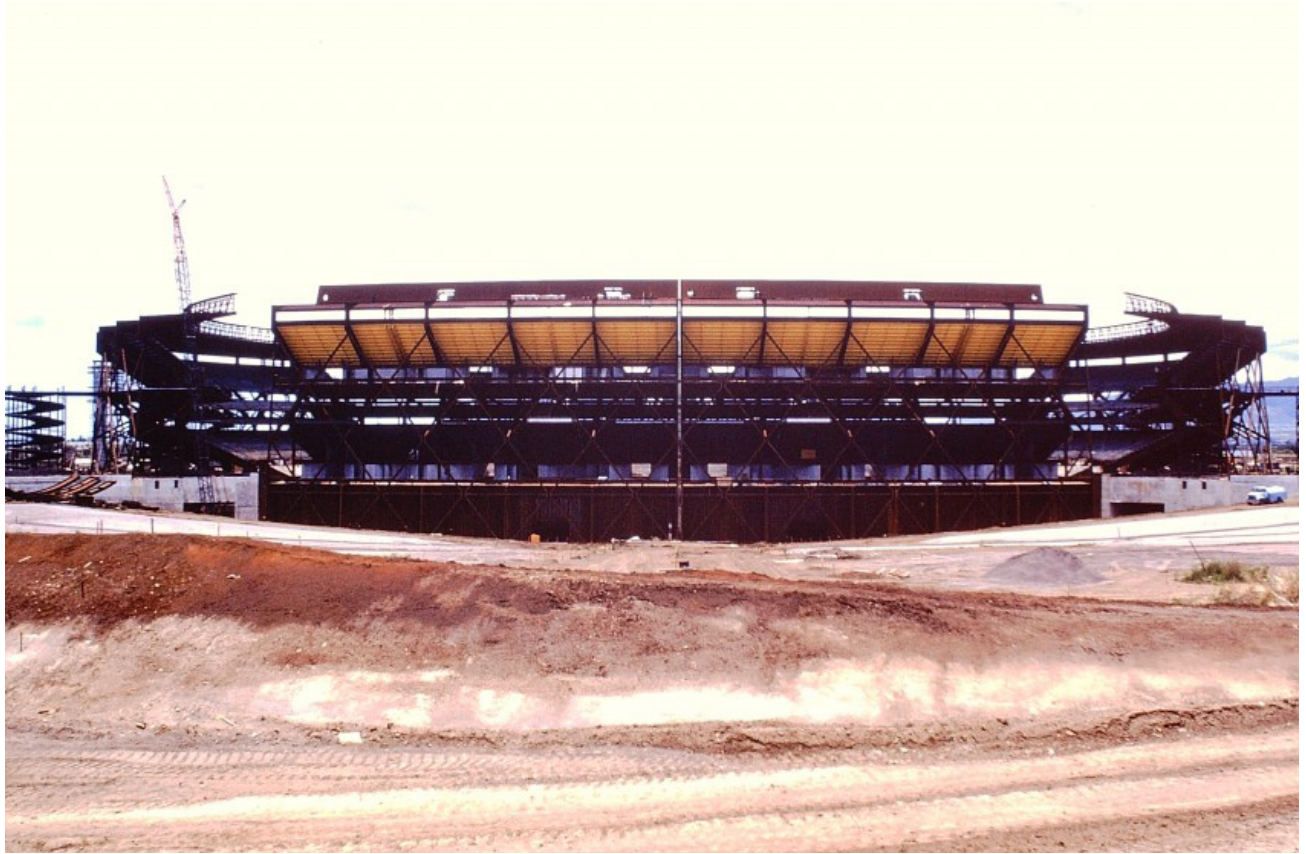
The iconic Aloha Stadium was built in 1975, Hawaii's largest outdoor stadium with 50,00 seats.