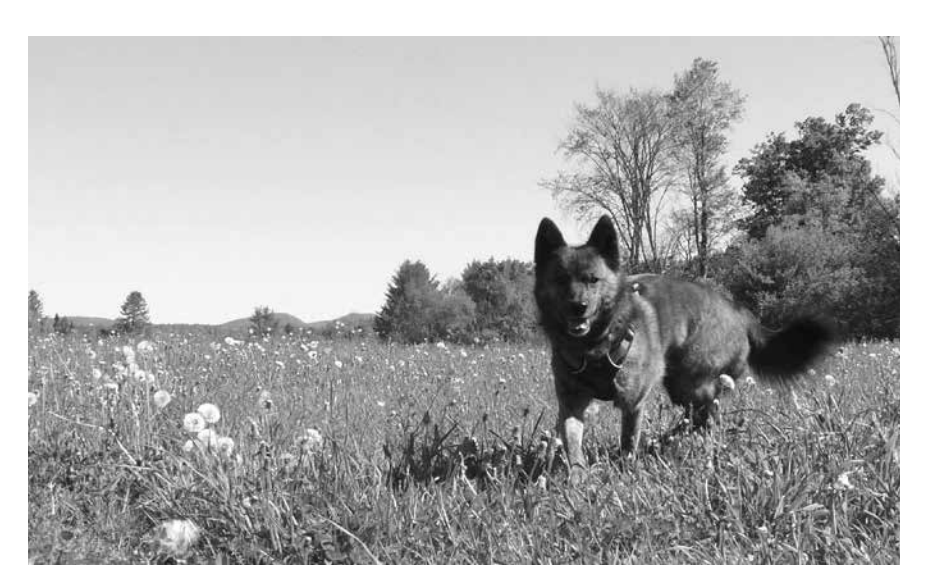
Juno enjoys a summer's day in the Utley Flats. Remember Summer?