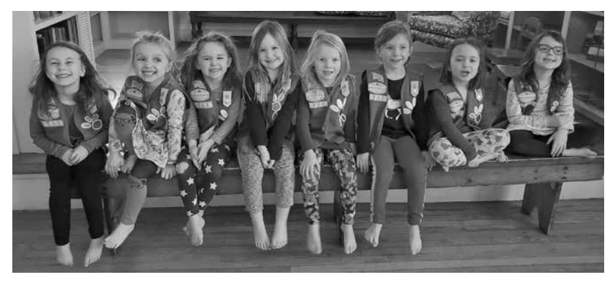
Landgrove's Daisy Girl Scout Troop 60250 These plucky Scouts grow and learn together on Thursday afternoons during the school year!