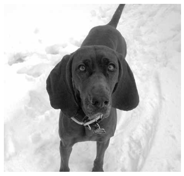
Dutchess on her morning patrol rounds in Landgrove Hollow.