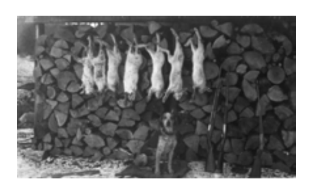
One of Richardson's hound dogs after a good day of rabbit hunting.