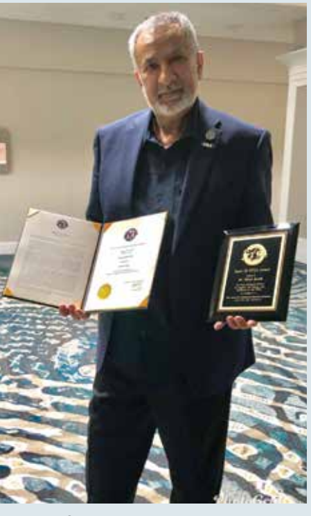
Spirit of NTOA Award:

For his dedication to the protection of his fellow officers during an incident on Aug. 3, 2018.