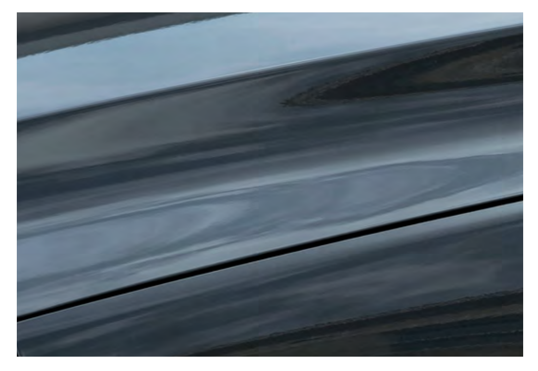
Visit our website to see all the vibrant color choices available.

Every aspect of our design process is intentional. Including the paint. Before a single drop of color is applied, master painters first perfect their technique by hand. Ensuring the surface of the Mazda3 has depth and saturation. Illuminating the curves and characteristics of our Kodo design. They apply color with the precision of highly sharpened senses. Even the machines used to paint the Mazda3 are so well calibrated that they replicate the exact movement of this human technique. Our daring array of lustrous finishes may be the final touch on the Mazda3, but it is the first thing that will catch your eye.