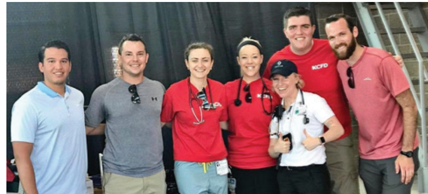
Good times with the Blue Angels!