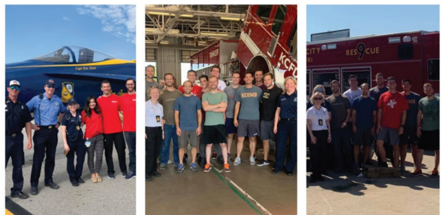
More EMS Good Times!