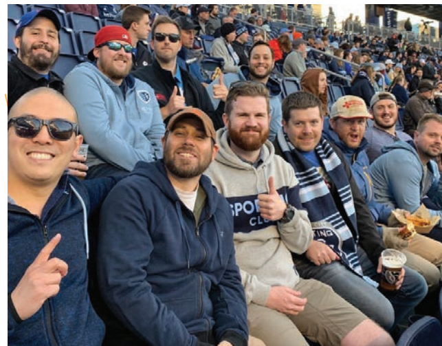
Wellness at Sporting KC and the Royals!