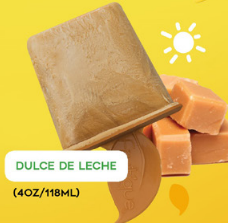
DULCE DE LECHE