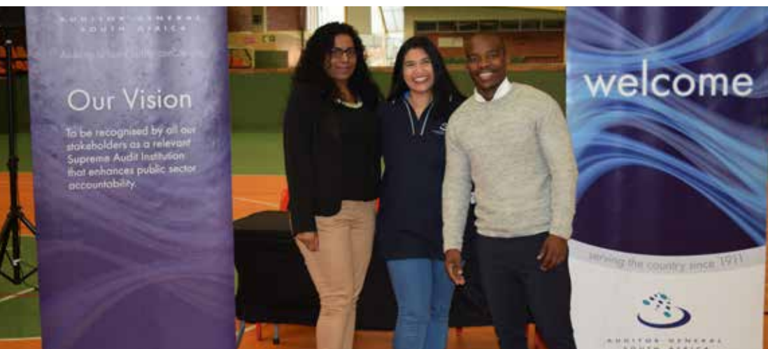
Accounting School holds successful postgraduate orientation.