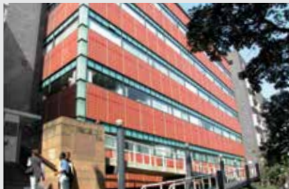
Nelson R. Mandela School of Medicine