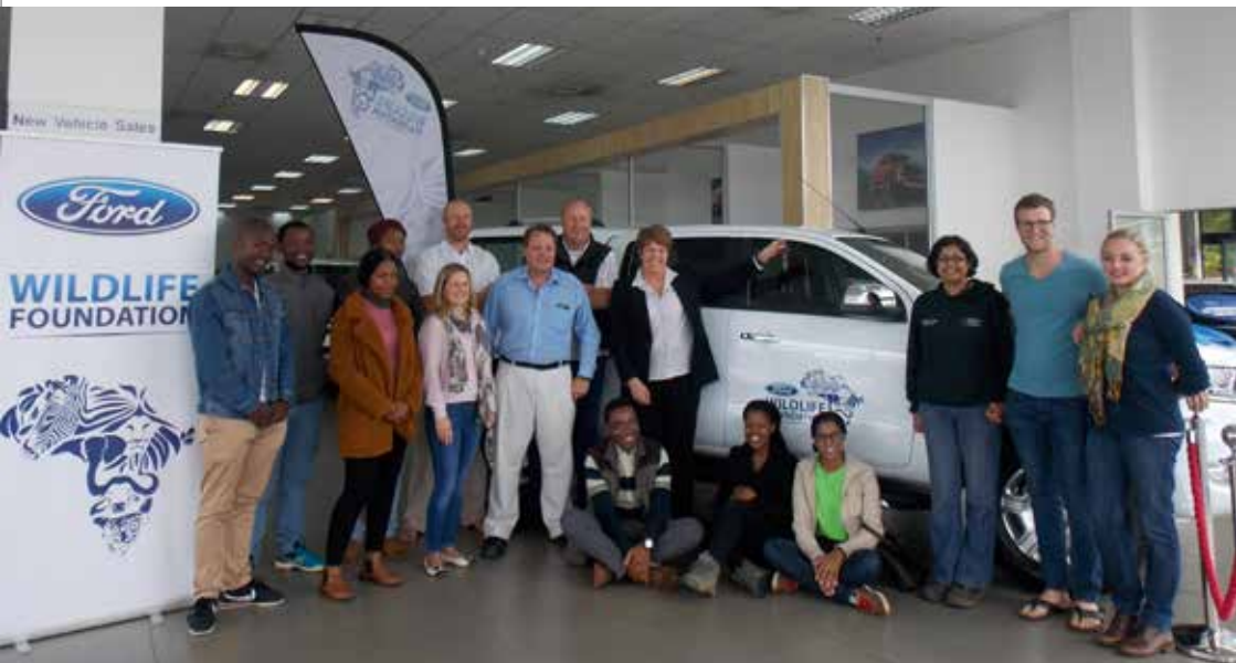
Life Sciences research benefits from Ford Wildlife Foundation research vehicle.

Tel: +27 (0)861 200 100/+27 (0)31 573 4189