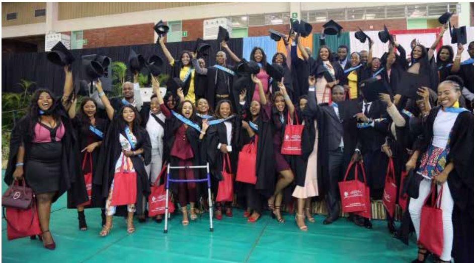
College of Humanities celebrates its graduates.