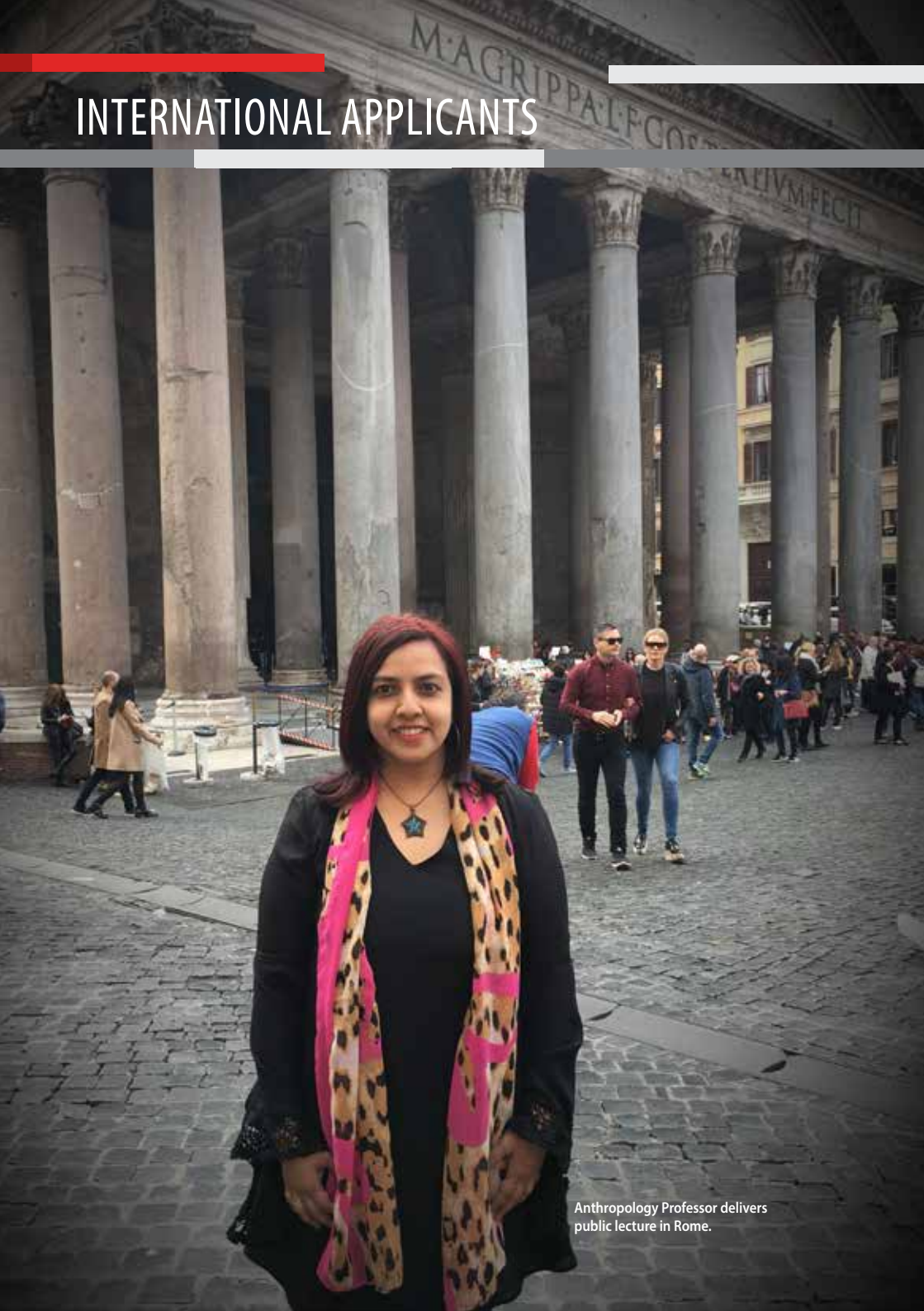
Anthropology Professor delivers public lecture in Rome.