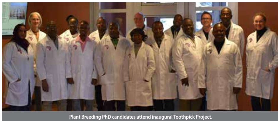
Plant Breeding PhD candidates attend inaugural Toothpick Project.