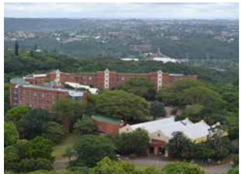
Old Mutual Sports Centre.