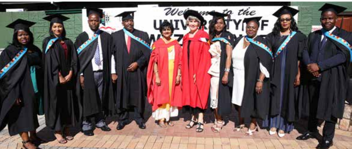
Dedication commitment pays off for 11 Teacher Development Studies Masters students.