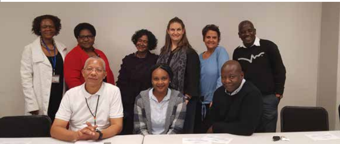
School of Education hosts Deaf Awareness Workshop.