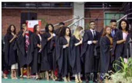
Graduates wait in line to be awarded their degrees.