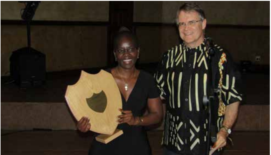
PhD Candidate's presentation at International Conference draws praise for women scientists.

Students will be required to pursue an approved programme of research on a subject falling within the scope of studies at the University. Such a programme shall make a distinct contribution to the knowledge or understanding of the subject and afford evidence of originality shown either by the discovery of new facts and by the exercise of independent critical power. Students must also adhere to other possible conditions prescribed by Colleges/Schools.