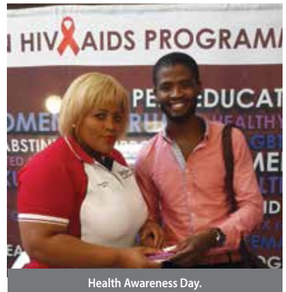
Health Awareness Day.