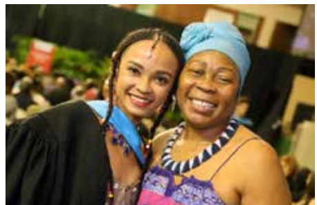
Renowned storyteller Gcina Mhlophe with her daughter.

The curriculum for the Honours degree shall include a prescribed research project as one of the modules that shall account for a minimum of 25% of the credits for the degree.