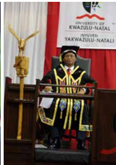
Chief Justice Mogoeng Mogoeng.