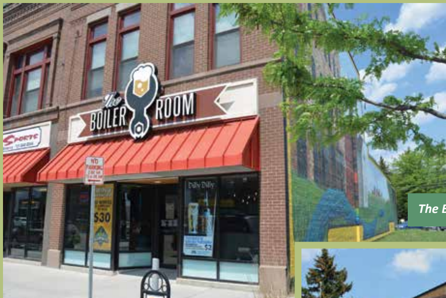
The Boiler Room

The two new restaurants generate restaurant tax funds to be used for community enhancement. Two vacant buildings are now restored, creating unique event spaces and bringing more visitors downtown during the evening hours.