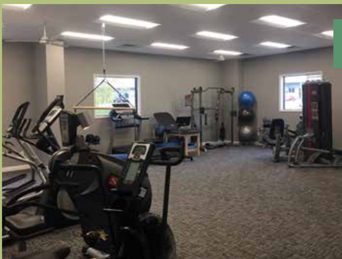
Mobility Plus, a physical and occupational therapy provider.

Building renovations helped establish new businesses, expand existing businesses, and increase job opportunities, creating an overall improvement in quality of life for the citizens of Valley City and Barnes County.