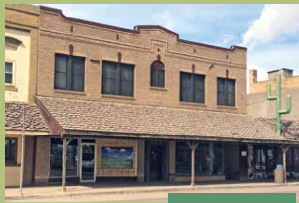
Store fronts before improvements.