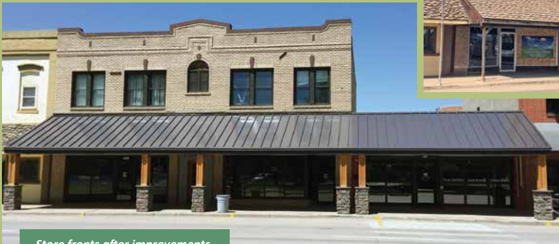
Store fronts after improvements.

The program is effectively stimulating investment by downtown businesses and commercial property owners to improve the appearance of their buildings. A total of 44 commercial projects have been completed since the program began in 2006 with $609,000 awarded as matching funds for slightly more than $2 million in improvement projects.