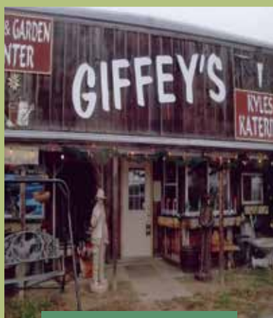
Kyles Katering before

The overall impact to the community is an increased quality of life for residents, the attraction of tourists to the town and the retention of local businesses.