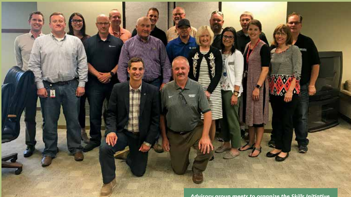
Advisory group meets to organize the Skills Initiative.

The program launched in 2017 and provides an ongoing dialogue about the needs of the community. The model is flexible and can evolve to ever-changing workforce needs.