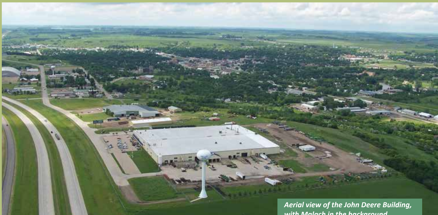
Aerial view of the John Deere Building, with Malach in the background.

The companies have contributed to various community projects and organizations directly impacting education, recreation, health and quality of life. Examples include the Career and Technology Center, Wellness for All Program, Sheyenne Valley Community Foundation, STEM education, Backpack Program and more.