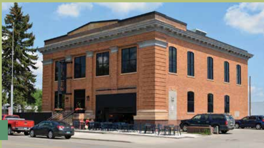
City Brew Hall