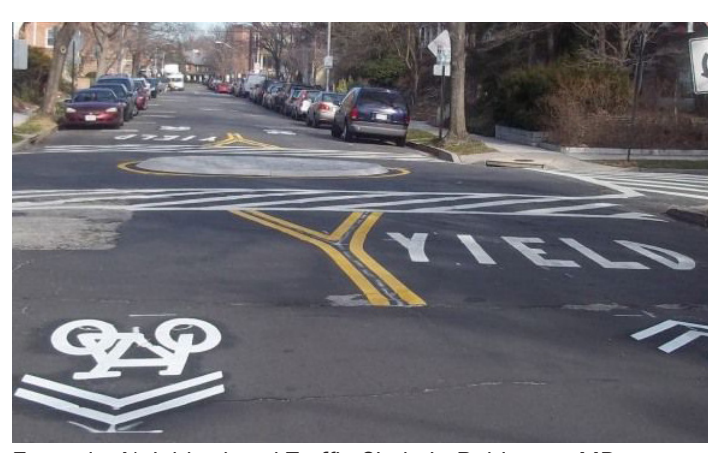
Example: Neighborhood Traffic Circle in Baltimore, MD.

Access needs to be maintained for larger emergency response vehicles