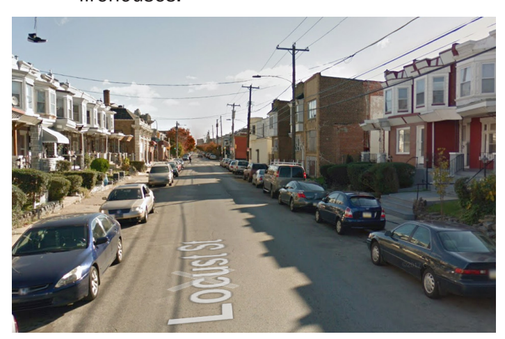
Example: Two-way streets with no painted center lines can be included within your Slow Zone.