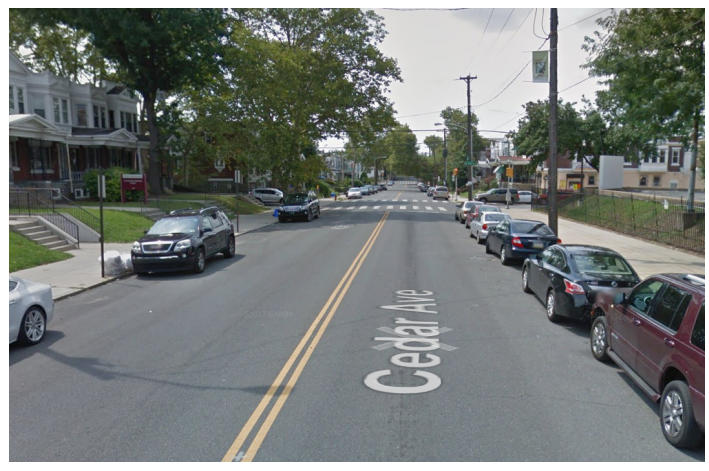
Example: Two-way street with a painted center line. This can be a boundary street.