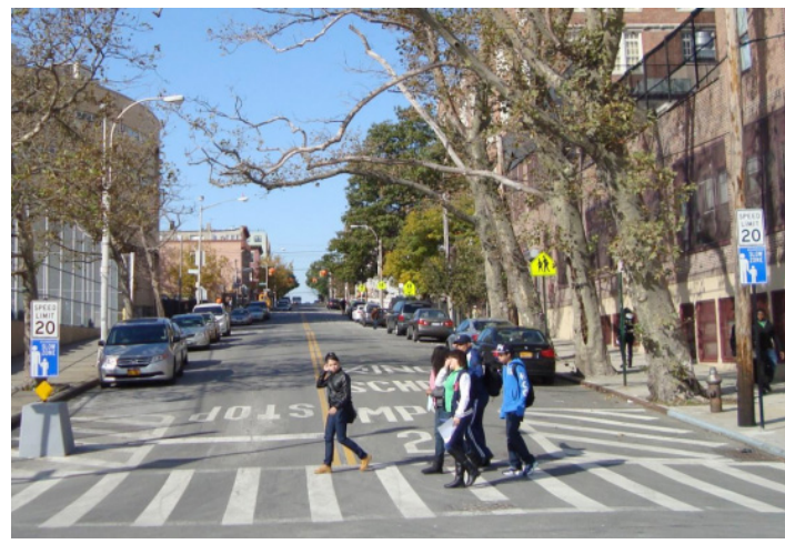
Example: Slow Zone "Gateway" treatment in Bronx, New York.

By keeping crosswalks clear of illegally parked cars, people walking will be visible to drivers approaching the crosswalk.