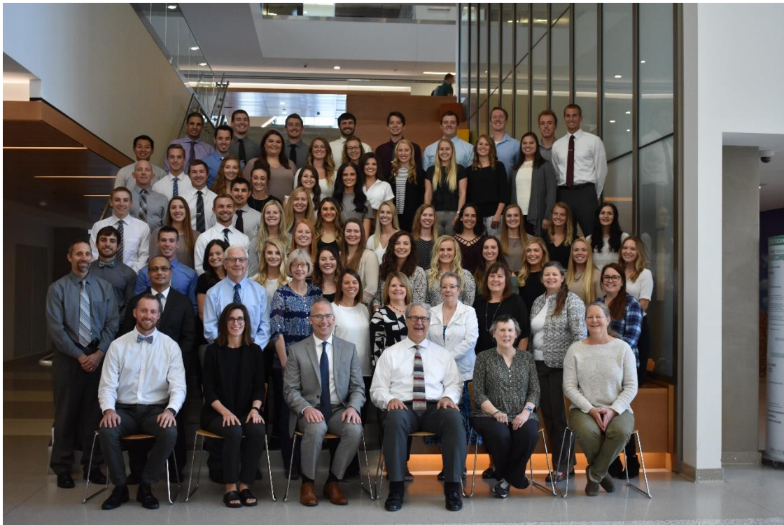
2020 STUDENTS, FACULTY AND STAFF