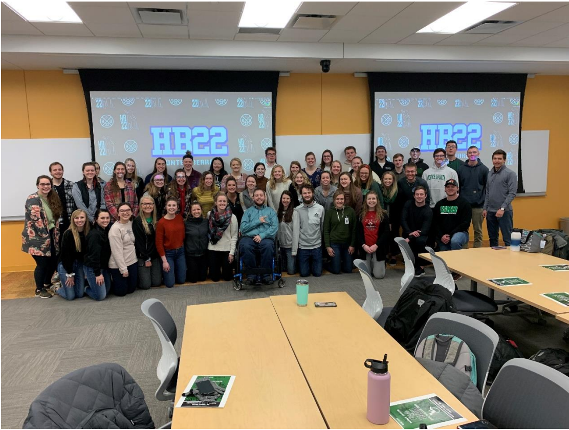
LUNCH AND LEARN EVENT-PT CLUB