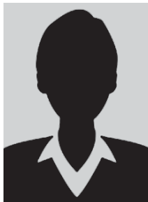
Vacant Vice President of Administrative and Fiscal Services