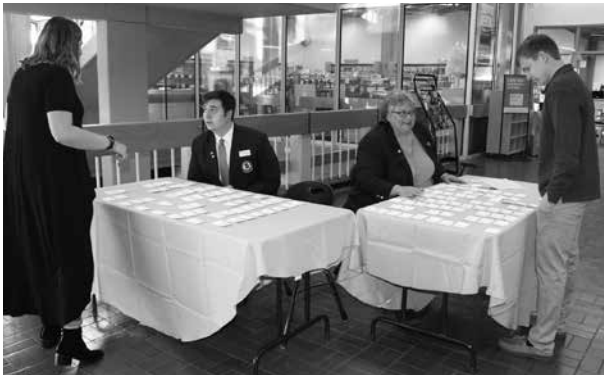
ACC Ambassadors welcomed guests at the 2019 Donor-Recipient Reception, hosted by the ACC Foundation.

SGA Office • 336-506-4239 Student Center Room 229, Main Building