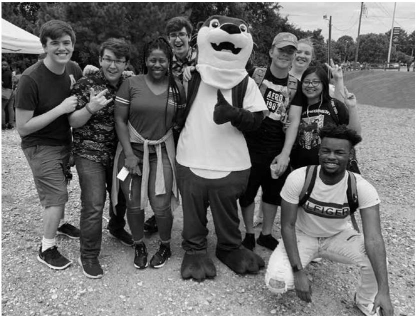
Haw the River Otter, Alamance Community College's new mascot, was introduced during the August 2019 ACC Day activities.

NOTE: All dates in the calendar were accurate at time of printing; however, check the College website for updates and changes throughout the year.