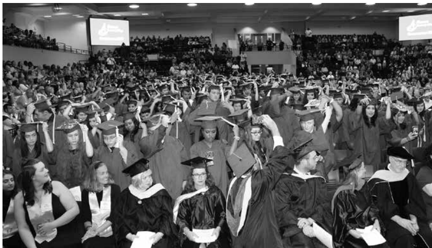
Pictured are the 2019 graduates of Alamance Community College. Commencement ceremonies were held at the Alumni Memorial Gymnasium at Elon University.