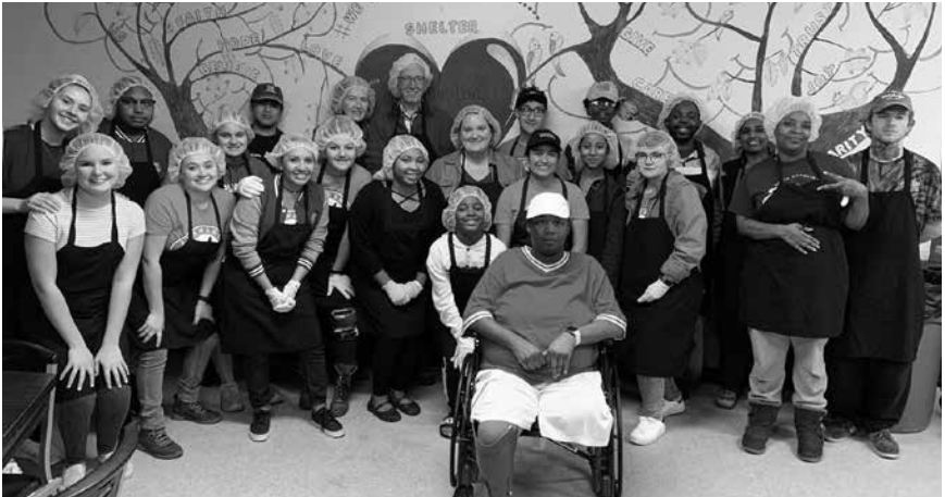
A group of ACC students spent the evening meal prepping and serving families and individuals at Allied Churches of Alamance County on Veterans Day.

PHI THETA KAPPA —Phi Theta Kappa is a chapter of the international honors fraternity serving two-year institutions which offer associate degrees. The purpose of the organization is to recognize and encourage scholarship, leadership, service, and the cultivation of fellowship among students in the community college system.