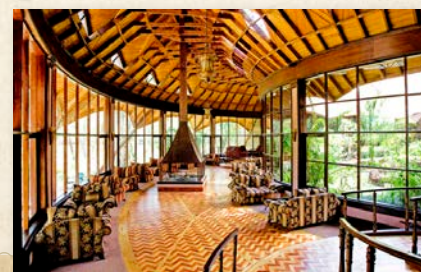
Sopa Lodge Naivasha

After breakfast depart for Sopa Lodge Naivasha set in one hundred and fifty acres of grassland studded with Acacia bushes and trees. Enjoy lunch viewing Thompson's Falls with an altitude of 7,738 feet. Proceed to Sopa Lodge Naivasha. The resort is not only home to resident giraffe, waterbuck and both Vervet and Colobus monkeys, but it is also a night stop for the hippos when they leave the lake every night to come and trim the grass on the lodge's expansive lawn. Interaction with AIM Missionaries. Dinner and overnight at Sopa Lodge. (B,L,D)