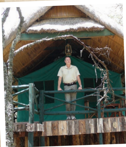
Relax at distinctive tented camps