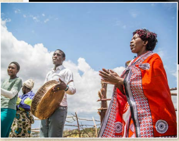
Spend time with the Dorobo people of Kenya