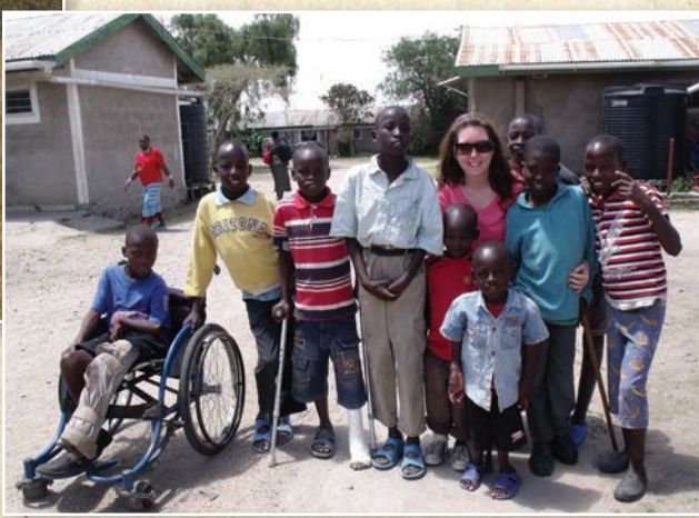
Ministry visits are a highlight of every tour.