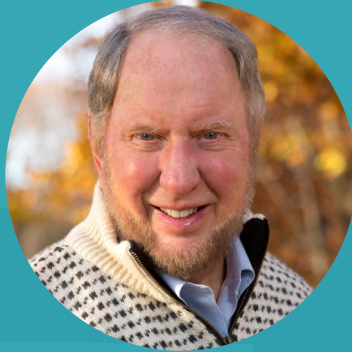
ROBERT D. PUTNAM PROFESSOR AT HARVARD UNIVERSITY AND COAUTHOR OF THE UPSWING

Robert D. Putnam is the Malkin Research Professor of Public Policy at Harvard University, having retired from active teaching in May 2018. Raised in a small town in Ohio, he was educated at Swarthmore, Oxford, and Yale. He has received 16 honorary degrees from eight countries, including the University of Oxford. In recent years, Putnam has been awarded the Skytte Prize, the world's highest accolade for a political scientist, the National Humanities Medal, and the Karl Deutsch Award from the International Political Science Association.