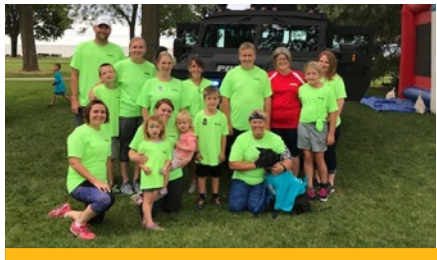
Cops for Kids