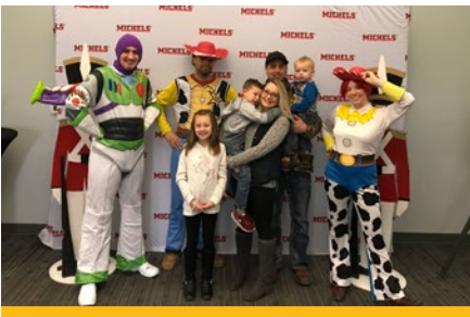
Breakfast With Santa