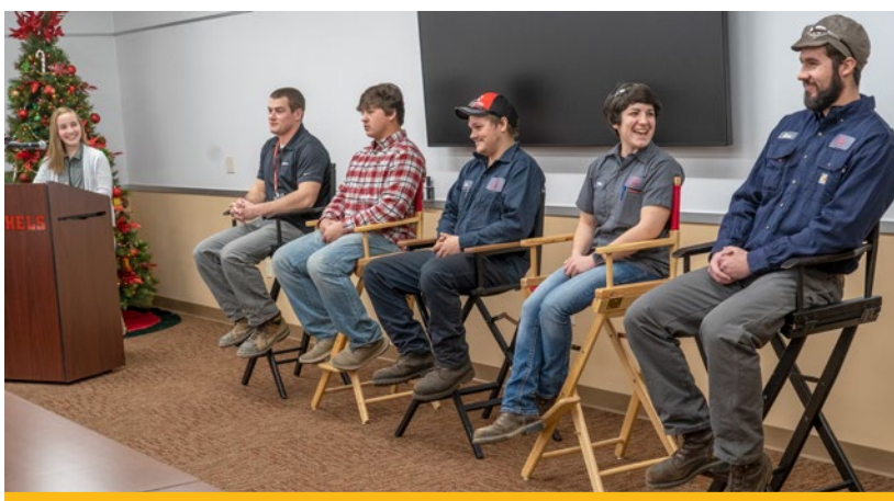
Future Business Leaders of America