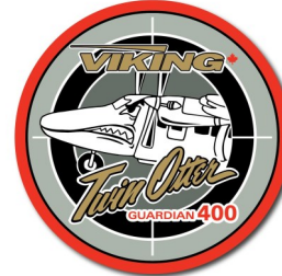
Animated Guardian 400