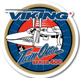
Animated Twin Otter Series 400