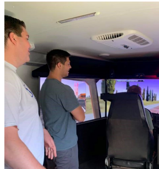
EM Residents at EMS Day