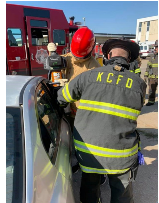
EM Residents at EMS Day