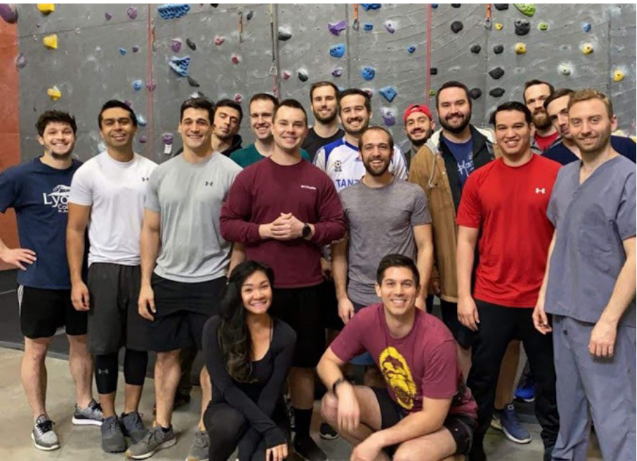
EM Residents at rock climbing