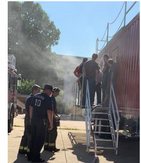
EM Residents at EMS Day