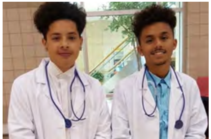
The Dr. Charles E. Brimm Medical Arts High School has graduated many students who have entered careers in health care.