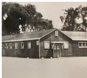
These WWII army barracks in Sandy Hill were the first home of the Faculty of Medicine.