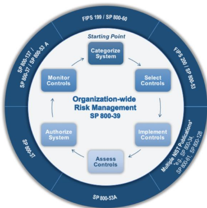
Figure 1: NIST Risk Management Framework

Beyond a selection of security controls, FISMA requires each agency to develop, document, and implement an agency-wide program to provide information security for the information and information systems that support the operations and assets of the agency, including those provided or managed by another agency, contractor, or other sources. The selection of security controls is part of a more comprehensive risk management framework based on NIST SP 800-37 Rev. 2, Risk Management Framework for Information Systems and Organizations: A System Life Cycle Approach for Security and Privacy . Figure 1 illustrates the major components of the risk management framework and the documents that guide each component.