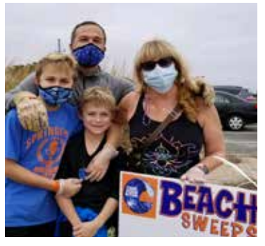
Beach Sweeps is a family-friendly event

Due to the COVID-19 pandemic, the Spring Beach Sweeps was cancelled and replaced with a Virtual Celebration of 35 Years of Beach Sweeps (pg. 4). Fortunately, the Fall event was held but added new challenges to ensure that activities complied with the Center for Disease Control and NJ Department of Health guidelines. Nearly 4,000 socially-distanced volunteers removed over 185,000 items at 60 locations (pg. 6). Given the times, COA added personal protective equipment (PPE) to the Fall 2020 Data Card. The 2020 Fall Beach Sweeps was unlike any other, and its success is a testament to the dedicated Beach Captains, towns, and volunteers.