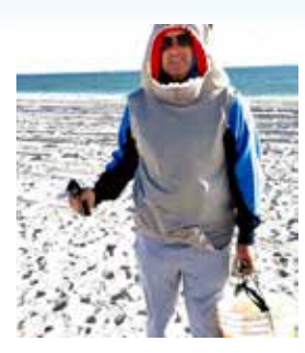
COA received submissions from Beach Sweepers over the years including a beach cleaning shark in Belmar, NJ