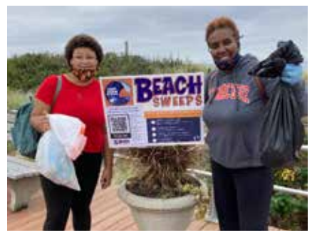
Happy volunteers proud of their work

In response, in 1985, Clean Ocean Action (COA) mobilized a small group of 75 people on Sandy Hook, NJ, and started removing the piles of trash. From this humble start, the Beach Sweeps evolved. Since then, every Spring and Fall for 35 years volunteers returned to give back by collecting, counting, and ridding the beach of trash. The data collected has been