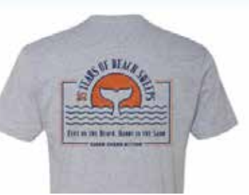
35th Annual Beach Sweeps t-shirt designed by Jetty Ink