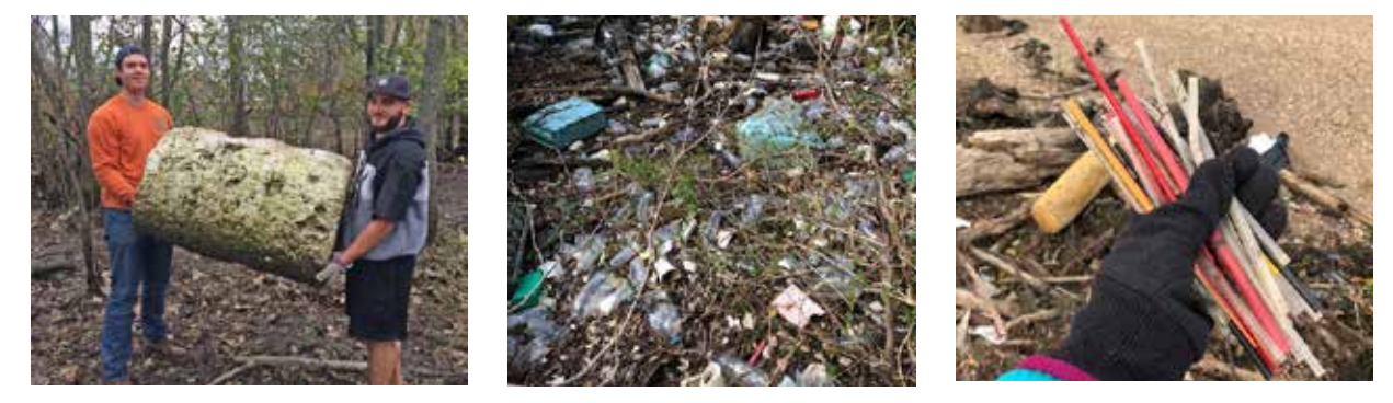
A citizen science initiative along the New Jersey side of the Delaware River launched in 2015 to identify "hotspots" of litter accumulation as part of COA's Reduce Litter in the Delaware River project

along and in the river, and that ultimately flow into the ocean. This report summarizes the results of the initial phases of the project, which included a citizen science initiative to remove debris and conduct a comprehensive assessment of litter accumulation. To read the report visit CleanOceanAction.org. Made possible thanks to the Environmental Endowment of NJ.