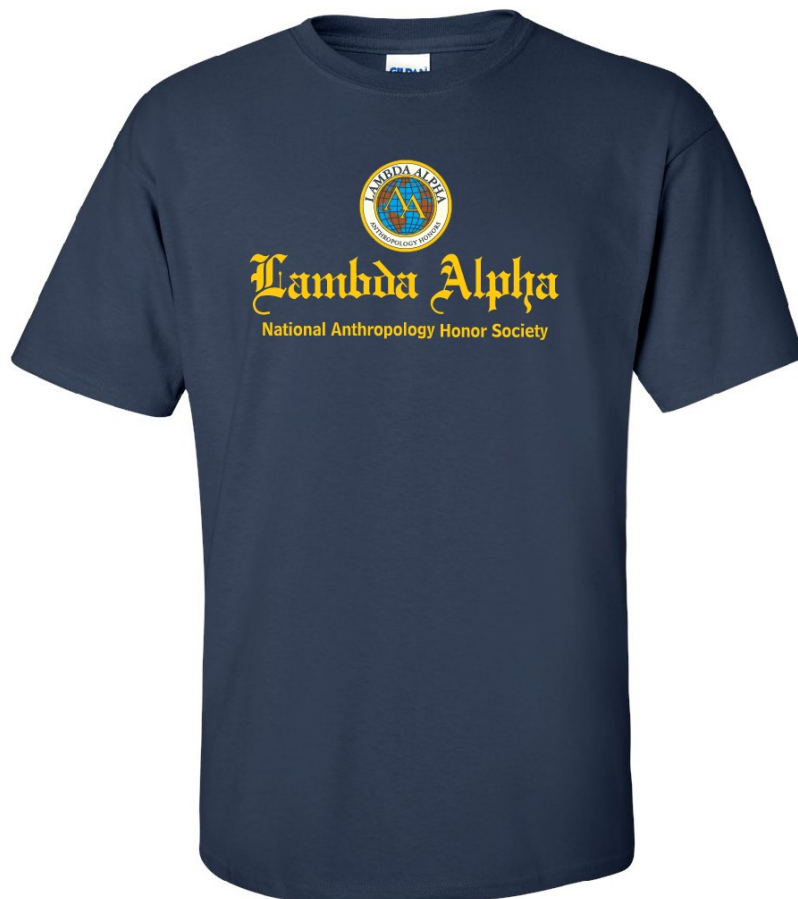
Lambda 38 Alpha