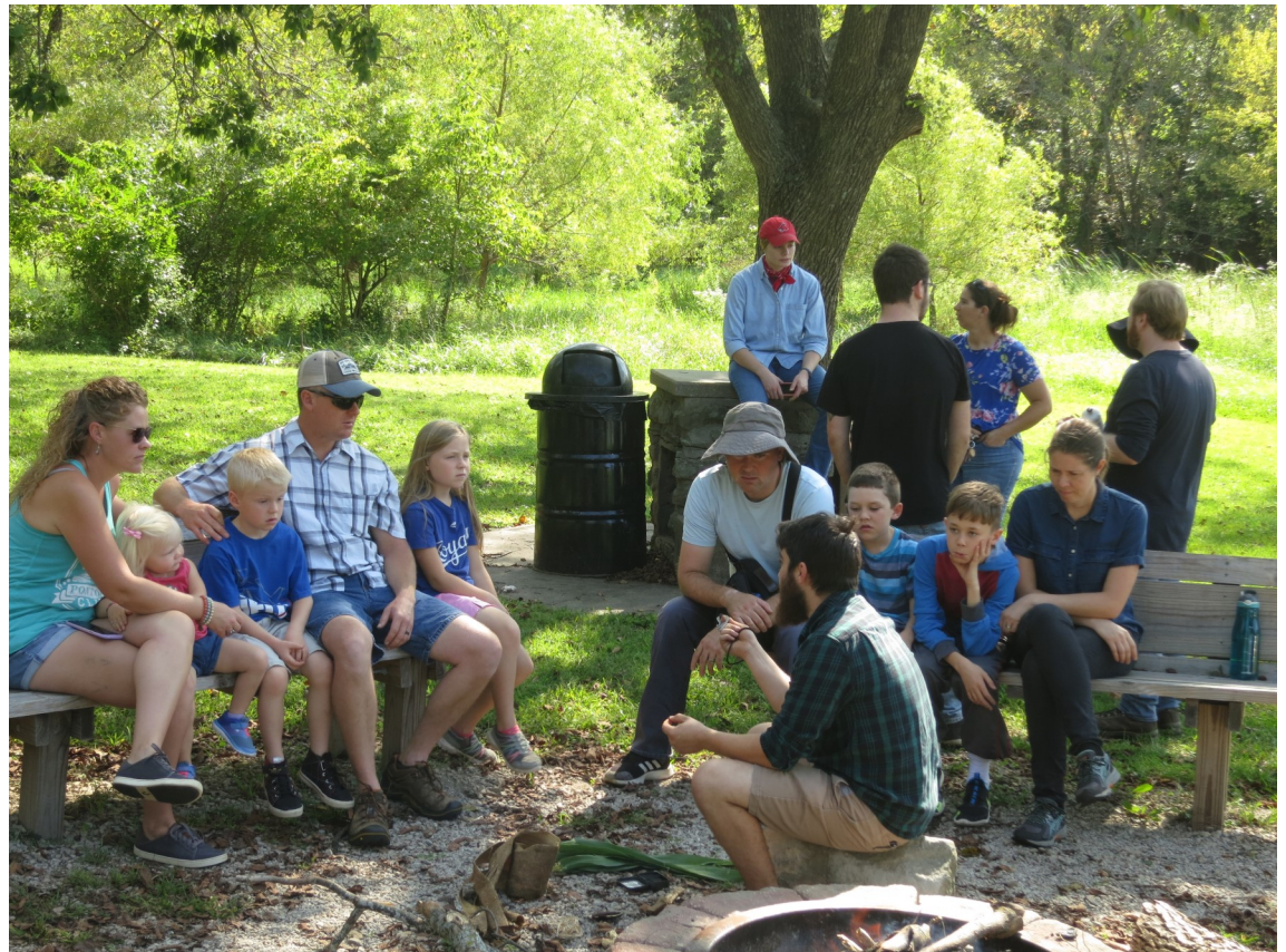
Anthropology student talking to Archaeology Field Day visitors.