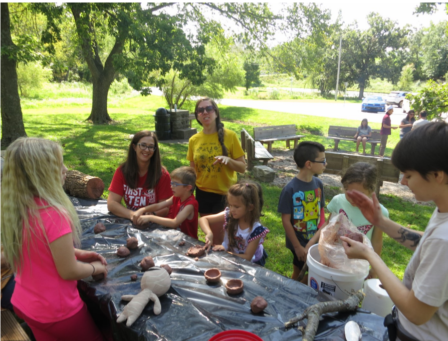
The pottery making table.