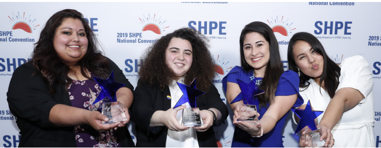
Student Role Models 2019 Winners