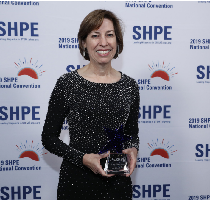
Dr. Ellen Ochoa, 2019