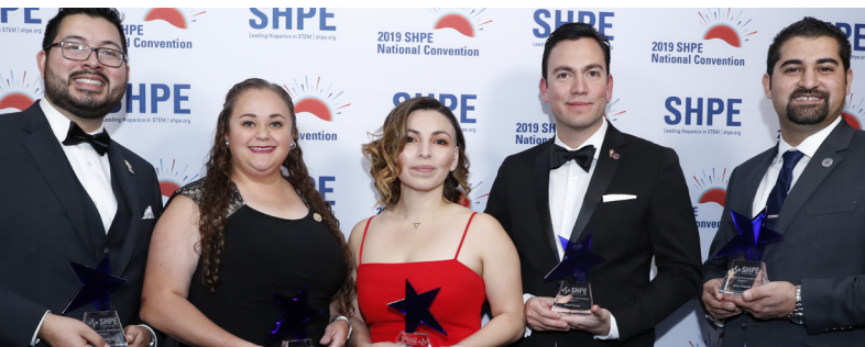
Professional Role Models 2019 Winners