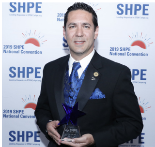
Accenture, Company of the Year 2019 Winner