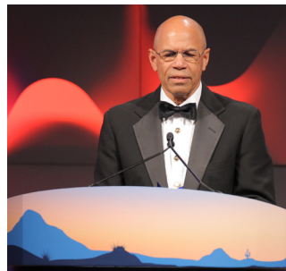
Department of Energy, Government Agency of the Year 2019 Winner