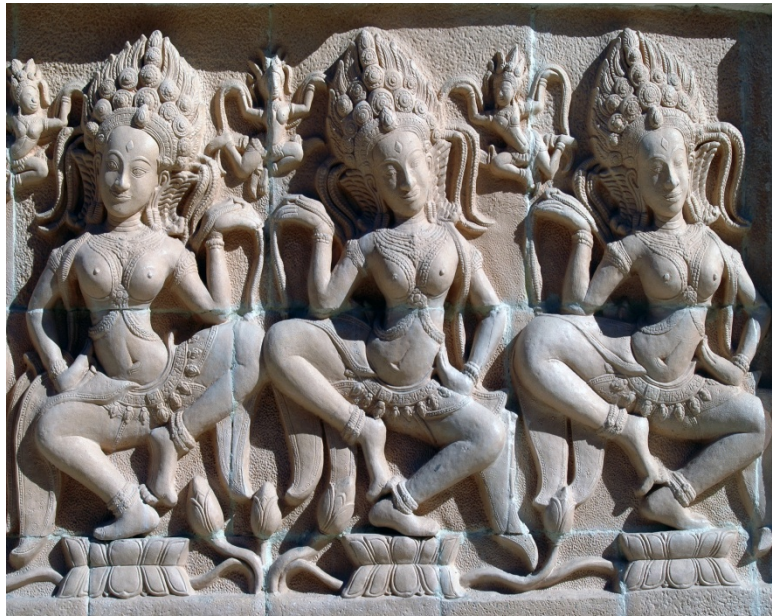
"Indian Stone Carving"