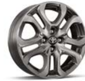
LE and XLE 16-in. Dark Gray split-spoke alloy wheel