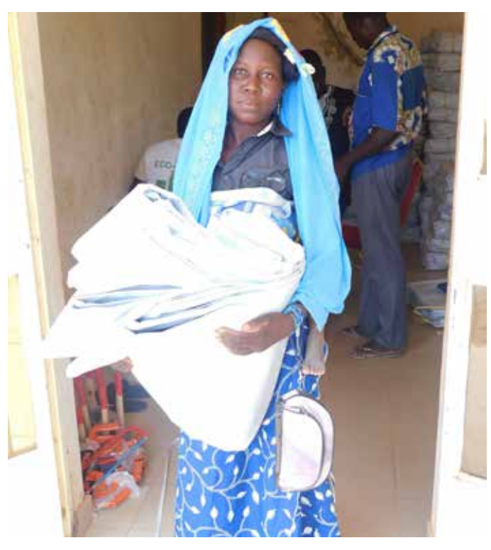
Aid distribution, Burkina Faso, 2020

Our top priority is to follow core humanitarian principles and do no harm. We are adapting and scaling our work to serve displaced communities that are most at risk of being devastated by the COVID-19 virus.