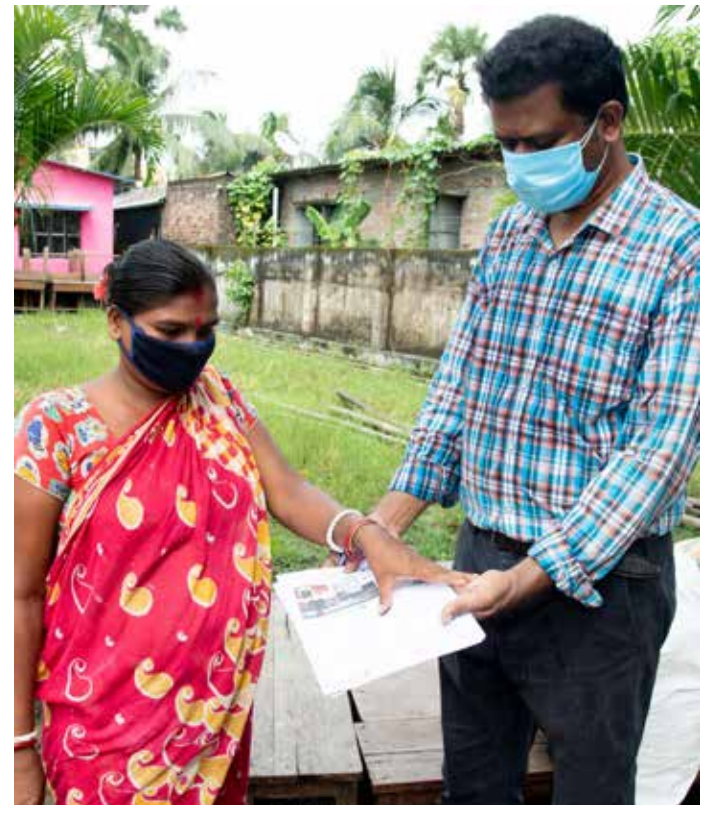
Beneficiary feedback station at a distribution site

Thanks to our partners and your support,1,400 families have tarpaulins, rope, household itsems and hygiene kits after Cyclone Amphan