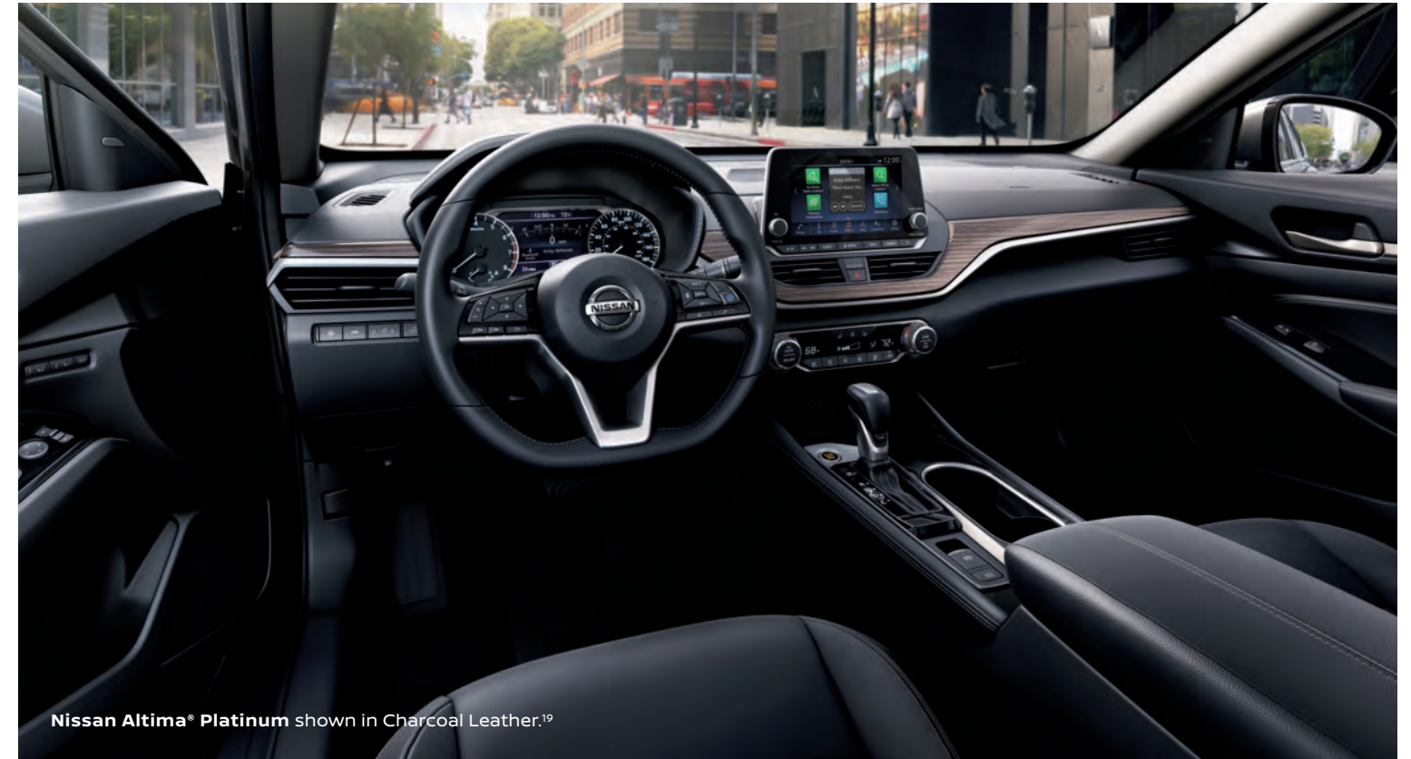
Nissan Altima ® Platinum shown in Charcoal Leather. 19