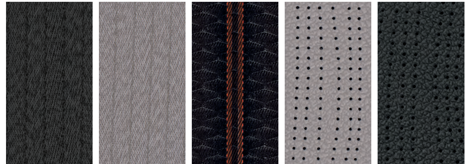
Charcoal Cloth S|SV