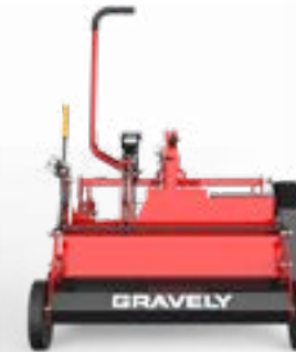
32 IN. DETHATCHER Model # 885917