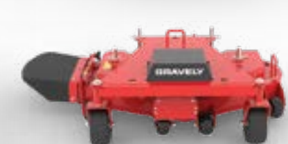
36 IN. FINISH MOWER Model # 885914 48 IN. FINISH MOWER Model # 885915