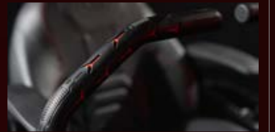
PREMIUM SOFT-TOUCH STEERING GRIPS