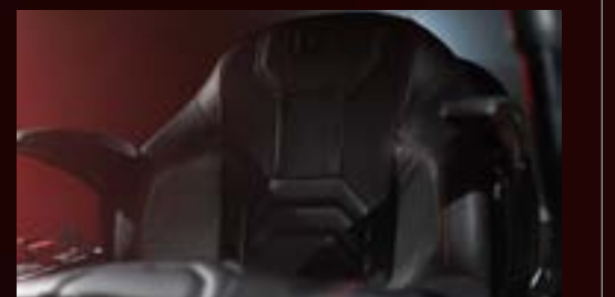
NEW HIGH BACK SEAT WITH SLIDER