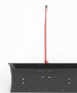
48 IN. BLADE Model # 885910