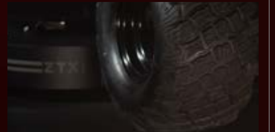
AGGRESSIVE, MILITARY-INSPIRED TREAD