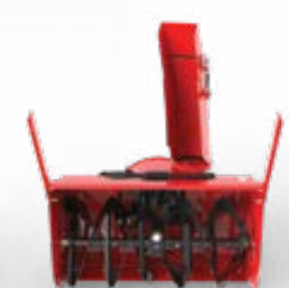
32 IN. SNOW BLOWER Model # 885912