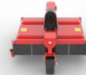
32 IN. BRUSH MOWER Model # 885913