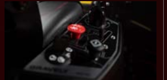
COCKPIT-INFLUENCED CONTROL CENTER