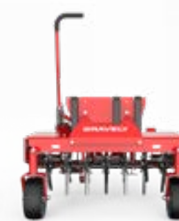
32 IN. AERATOR Model # 885916