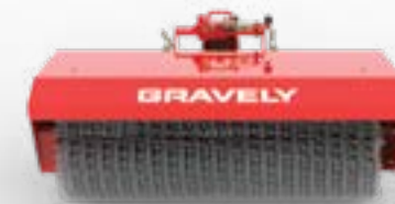
44 IN. BRUSH Model # 885911

The Pro-QXT Tractor provides quick, single-person attachment changes with minimal effort, allowing the operator to easily transition between attachments.