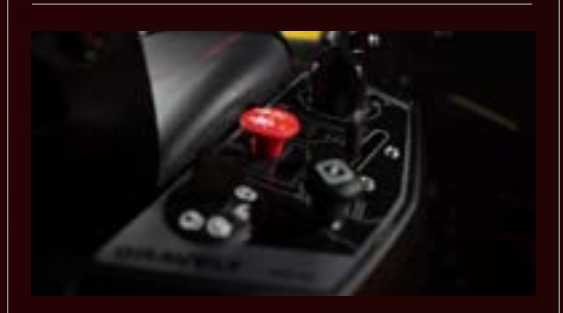
COCKPIT-INFLUENCED CONTROL CENTER