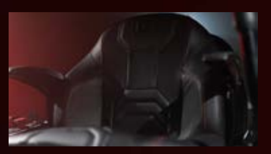
NEW HIGH BACK SEAT WITH SLIDER