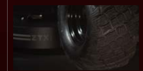
AGGRESSIVE, MILITARY-INSPIRED TREAD