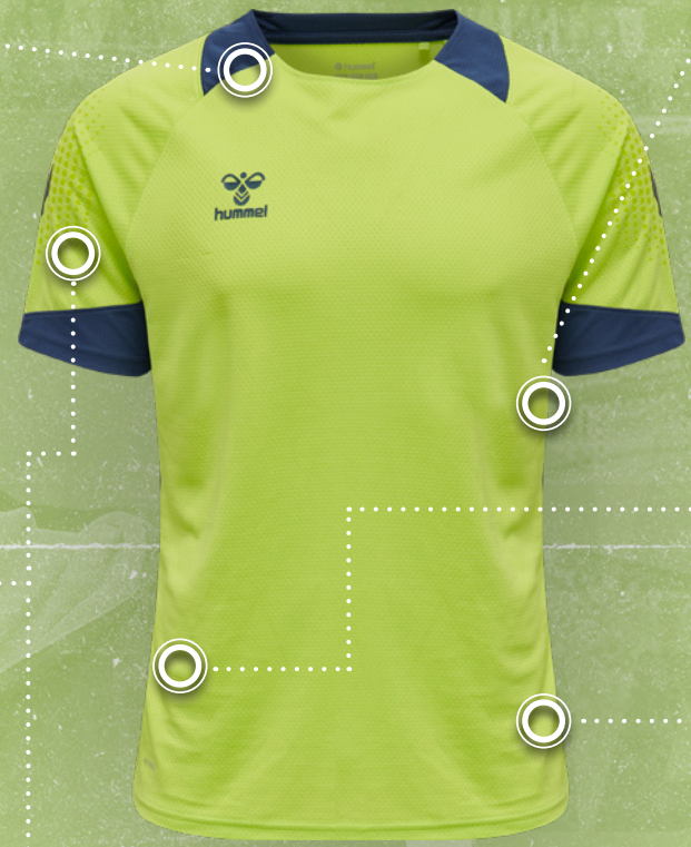
BEECOOL moisture management