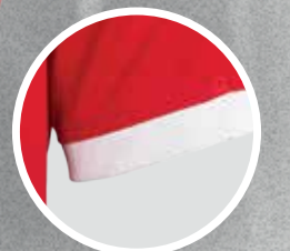
details on the arm