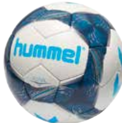
SIZE 2,4 : 9814 WHITE/VINTAGE INDIGO/TURQUOISE SIZE 3 : 9813 WHITE/VINTAGE INDIGO/GREEN