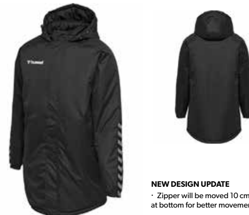
NEW DESIGN UPDATE · Zipper will be moved 10 cm up at bottom for better movement

205-363 YOUTH: YS YM YL 205-362 MEN'S: XS S M L XL 2XL $119.95