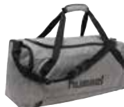
2006 GREY MELANGE