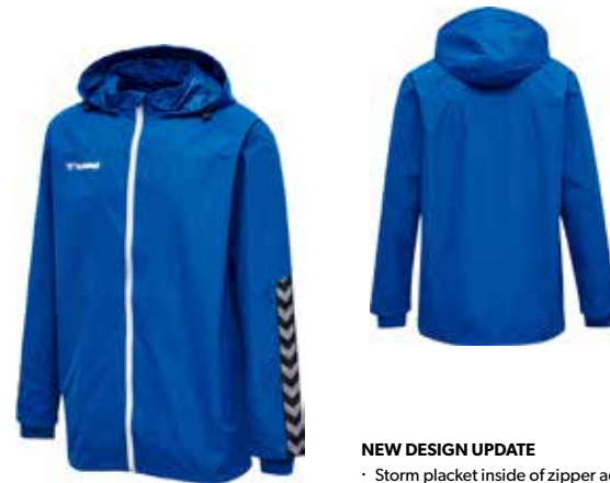
NEW DESIGN UPDATE · Storm placket inside of zipper added

205-365 YOUTH: YS YM YL 205-364 MEN'S: XS S M L XL 2XL $99.95