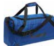
7079 TRUE BLUE/BLACK