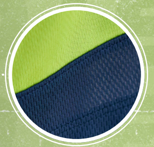
Open mesh and flat knit structure material combination