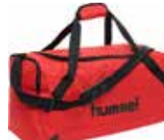
3081 TRUE RED/BLACK