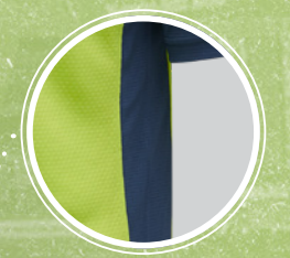
Open mesh structure angled sidepanel