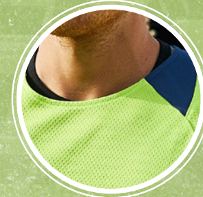
Cut and sew neckline construction