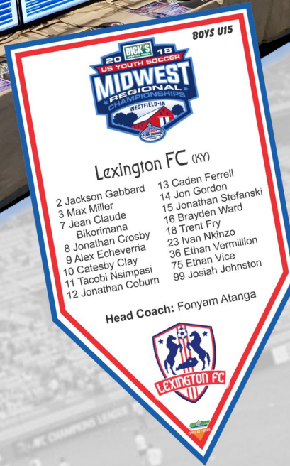
12"x18" TEAM BANNERS