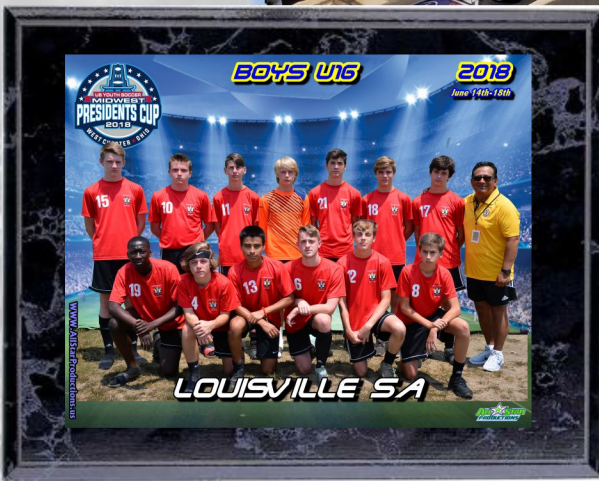
10"x13" TEAM PLAQUE