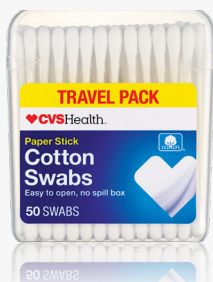
Cotton Swabs 50 CT, Sku 395417 $1.00