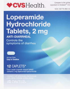
Anti-Diarrheal Tablets 12 CT, Sku 672550 $6.00