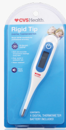
Digital Thermometer 1 CT, Sku 155912 $8.00