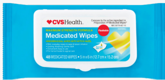
Hemorrhoidal Wipes 48 CT, Sku 401472 $6.00