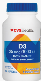
Vitamin D3 1000 IU 120 CT, Sku 346754 $7.00