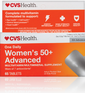
Adult Daily Women's 50+ 65 CT, Sku 448393 $8.00