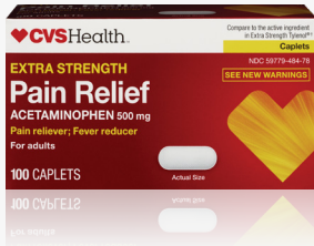
Acetaminophen 500mg 100 CT, Sku 371914 $7.00