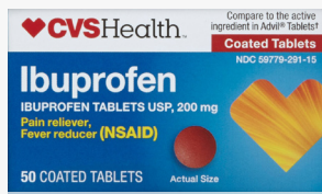
Ibuprofen 200mg 50 CT, Sku 371948 $4.00