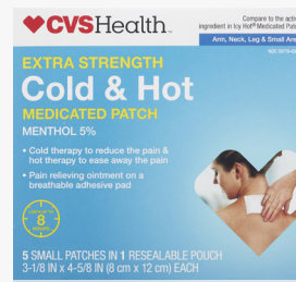
Hot/Cold Patches 5 CT, Sku 957604 $6.00