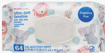
Unscented Wipes 64 CT, Sku 571810 $3.00