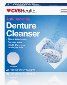
Denture Cleanser Tabs 40 CT, Sku 213330 $3.00