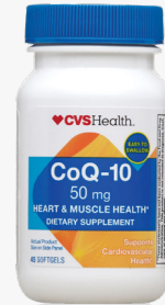
Coenzyme Q-10 50mg 45 CT, Sku 122869 $12.00