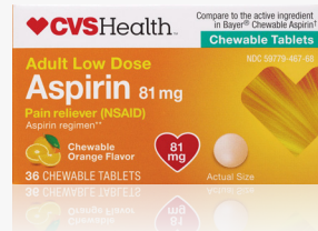
Chewable Aspirin 81mg 36 CT, Sku 547802 $2.00