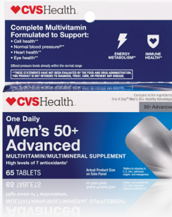
Adult Daily Men's 50+ 65 CT, Sku 448404 $8.00