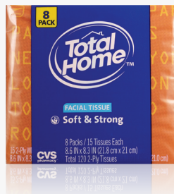
Facial Tissue 8 PK, Sku 265212 $2.00