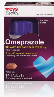
Omeprazole Tablets 14 CT, Sku 451300 $10.00