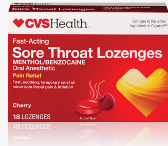
Sore Throat Lozenges 18 CT, Sku 707032 $4.00