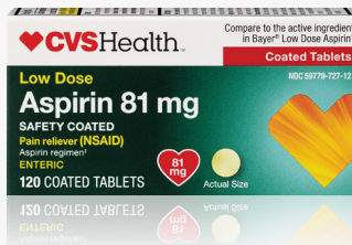
Enteric Aspirin 81mg 120 CT, Sku 230268 $5.00