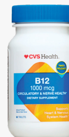
B-12 1000mcg 60 CT, Sku 247321 $7.00