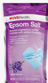
Epsom Salt 22 OZ, Sku 482649 $5.00