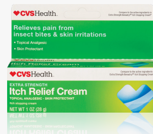
Anti Itch Cream 1 OZ, Sku 550749 $5.00