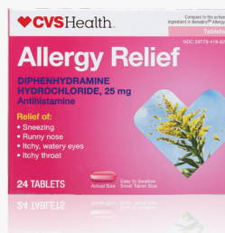
Allergy Relief Tablets 24 CT, Sku 477066 $4.00