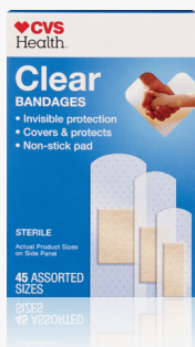
Clear Bandages 45 CT, Sku 383505 $4.00