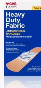
Heavy Duty Fabric Bandages 20 CT, Sku 875957 $4.00