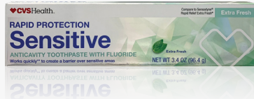
Sensitive Toothpaste 3.4 OZ, Sku 368775 $4.00