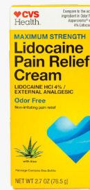
Lidocaine Cream 2.7 OZ, Sku 977934 $7.00