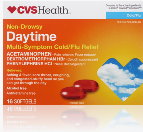
Daytime Cold/Flu Soft Gels 16 CT, Sku 890425 $6.00