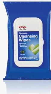
Flushable Wipes 42 CT, Sku 843837 $4.00