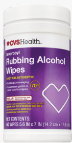
Rubbing Alcohol Wipes 40 CT, Sku 444797 $5.00