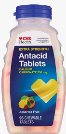
Antacid Tablets 96 CT, Sku 836320 $5.00