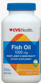
Fish Oil Omega-3 1000mg 120 CT, Sku 460962 $10.00