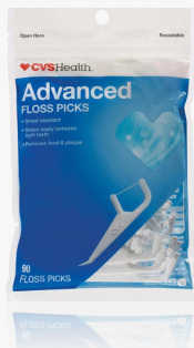
Flosser Picks 90 CT, Sku 454381 $3.00