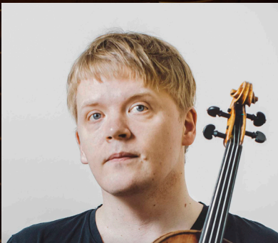
Pekka Kuusisto Plays The Lark Ascending May 20–22 Pekka Kuusisto, director and violin