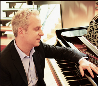
Jeremy Denk Plays Mozart's Piano Concerto No. 14 Oct 29–31 Jeremy Denk, director and piano