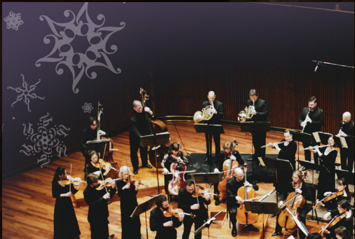
Holiday Concerts: Bach's Brandenburg Concertos Concertos 1, 3 and 5: Dec 9–11 Concertos 2, 4 and 6: Dec 17–19 Led by SPCO Musicians