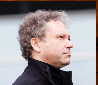
Haydn's Clock Symphony with Richard Egarr Feb 18–19 Richard Egarr, conductor and harpsichord