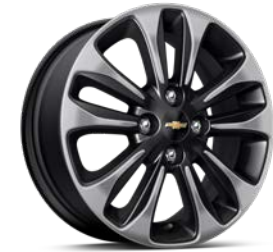
15" Black-Painted Machined-Finish Aluminum Wheels Available on 1LT with Spark Special Edition