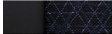
Jet Black Cloth