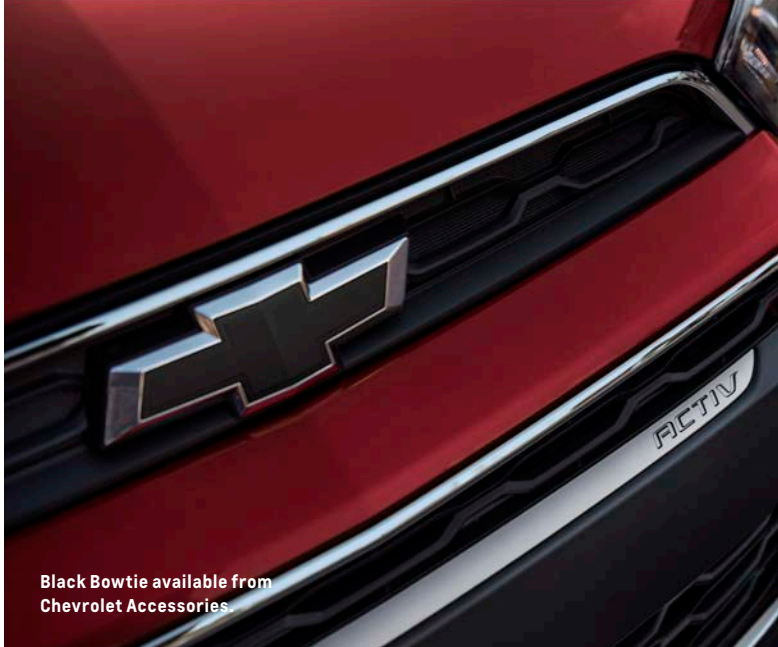
Black Bowtie available from Chevrolet Accessories.