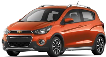
Cayenne Orange 1