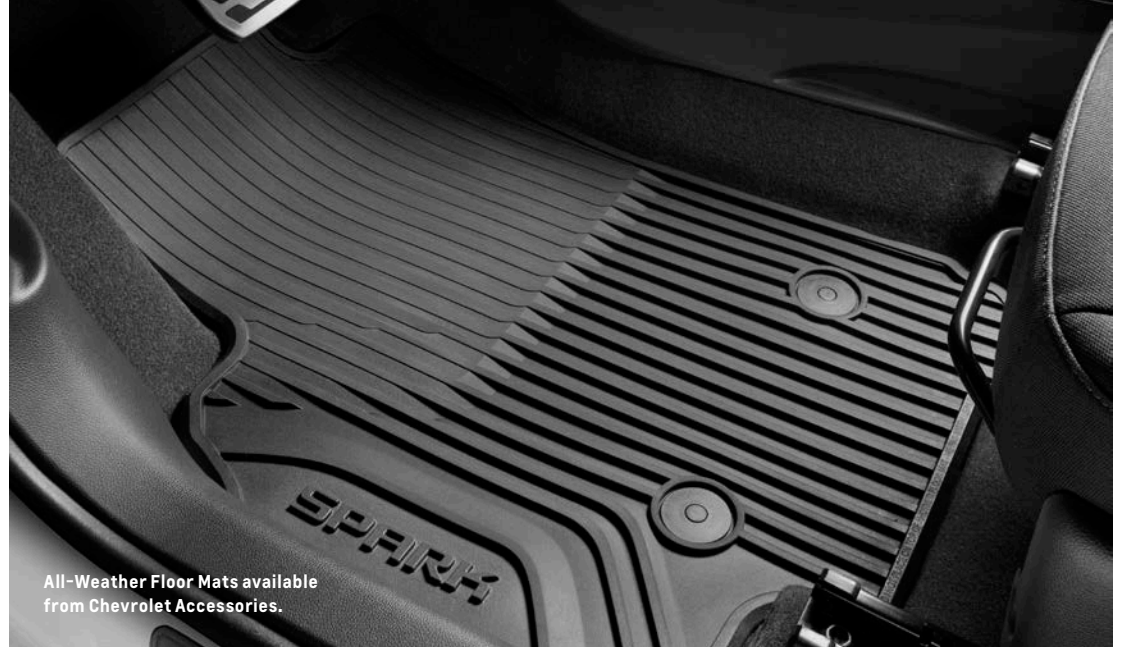
All-Weather Floor Mats available from Chevrolet Accessories.