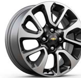
15" Gunmetal Silver-Painted Aluminum Wheels Standard on ACTIV