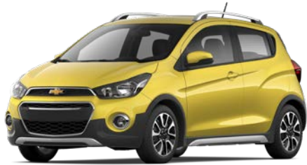
Nitro Yellow 1