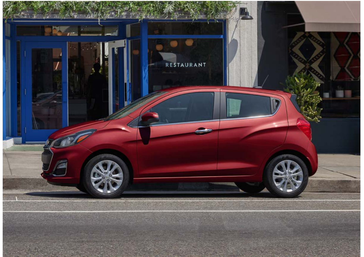
Spark 2LT in Crimson.

Going small can be the fastest way to keep up in today's world. Chevrolet Spark is not only fun to drive, but it also fits almost anywhere you want to go, with space for friends and fun. Spark offers innovative safety features and smart technologies that help keep you connected along the way. Better yet, you'll now have your pick of all those too-small-for-everybody-else parking spots.