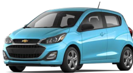
Mystic Blue 1