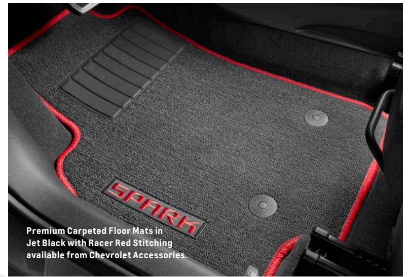
Premium Carpeted Floor Mats in Jet Black with Racer Red Stitching available from Chevrolet Accessories.