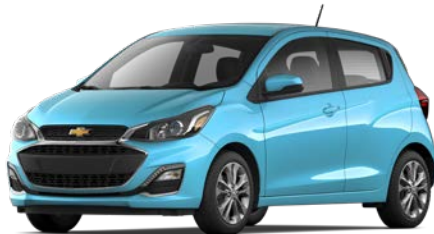
Mystic Blue 1