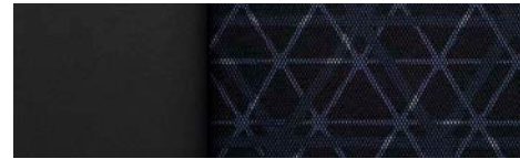
Jet Black Cloth with Dark Anderson Silver Accent Trim