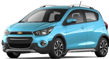
Mystic Blue 1