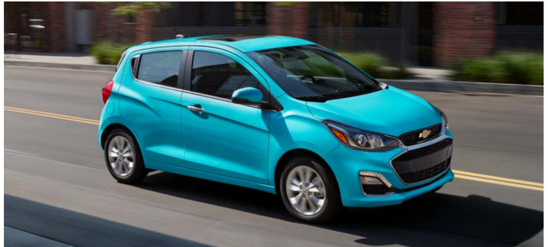
Spark 2LT in Mystic Blue (extra-cost color).

1 Chevrolet Infotainment System functionality varies by model. Full functionality requires compatible Bluetooth and smartphone, and USB connectivity for some devices. 2 Vehicle user interface is a product of Apple and its terms and privacy statements apply. Requires compatible iPhone and data plan rates apply. 3 Vehicle user interface is a product of Google, and its terms and privacy statements apply. Requires the Android Auto app on Google Play and a compatible Android smartphone. Data plan rates apply. You can check which smartphones are compatible at g.co/androidauto/requirements . 4 Service varies with conditions and location. Requires active service and paid AT&T data plan. Visit onstar.com for details and limitations. 5 Not compatible with all devices. 6 Cargo and load capacity limited by weight and distribution. 7 Safety or driver assistance features are no substitute for the driver's responsibility to operate the vehicle in a safe manner. Read the vehicle Owner's Manual for important feature limitations and information.