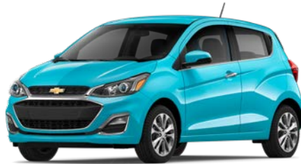
Mystic Blue 1