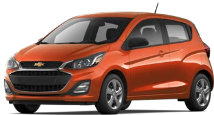
Cayenne Orange 1