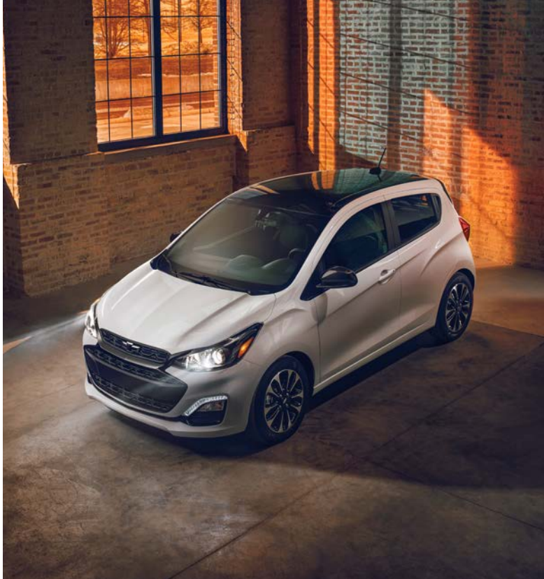
Spark Special Edition.