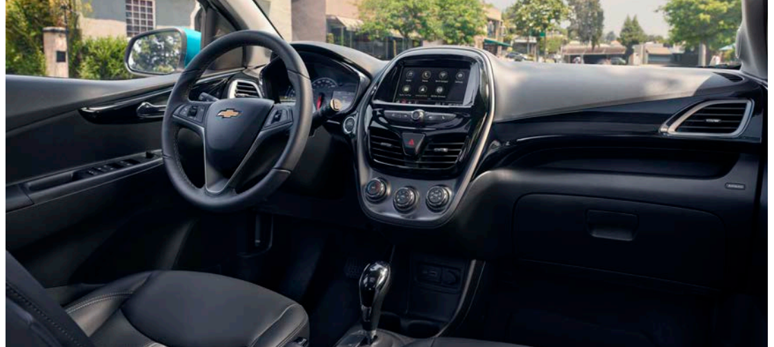
Spark 2LT interior in Jet Black.