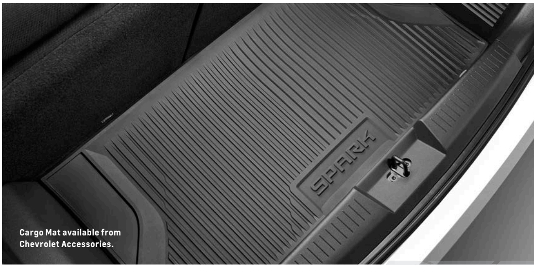
Cargo Mat available from Chevrolet Accessories.