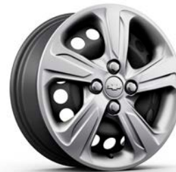
15" Steel Wheels with Painted Wheel Covers Standard on LS