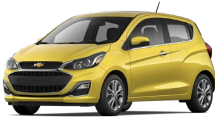
Nitro Yellow 1