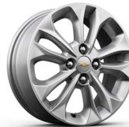
15" Silver-Painted Aluminum Wheels Standard on 2LT

1 Chevrolet Infotainment System functionality varies by model. Full functionality requires compatible Bluetooth and smartphone, and USB connectivity for some devices. 2 Safety or driver assistance features are no substitute for the driver's responsibility to operate the vehicle in a safe manner. Read the vehicle Owner's Manual for important feature limitations and information. 3 If you decide to continue service after your trial, your selected subscription plan will automatically renew thereafter. You will be charged at then-current rates. Fees and taxes apply. To cancel you must call SiriusXM at 1-866-635-2349. See SiriusXM Customer Agreement for complete terms at siriusxm.com . All fees and programming subject to change.