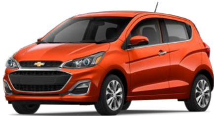
Cayenne Orange 1