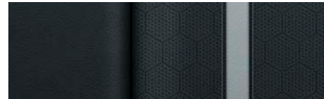
Jet Black Leatherette with Dark Anderson Silver Accent Stripe and Accent Trim