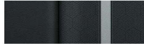
Jet Black Leatherette with Dark Anderson Silver Accent Stripe and Accent Trim