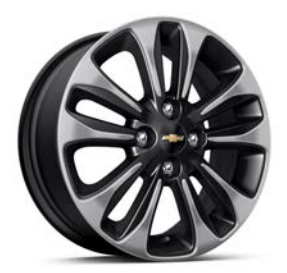
15" Black-Painted Machined-Finish Aluminum Wheels Available on 1LT with Spark Special Edition