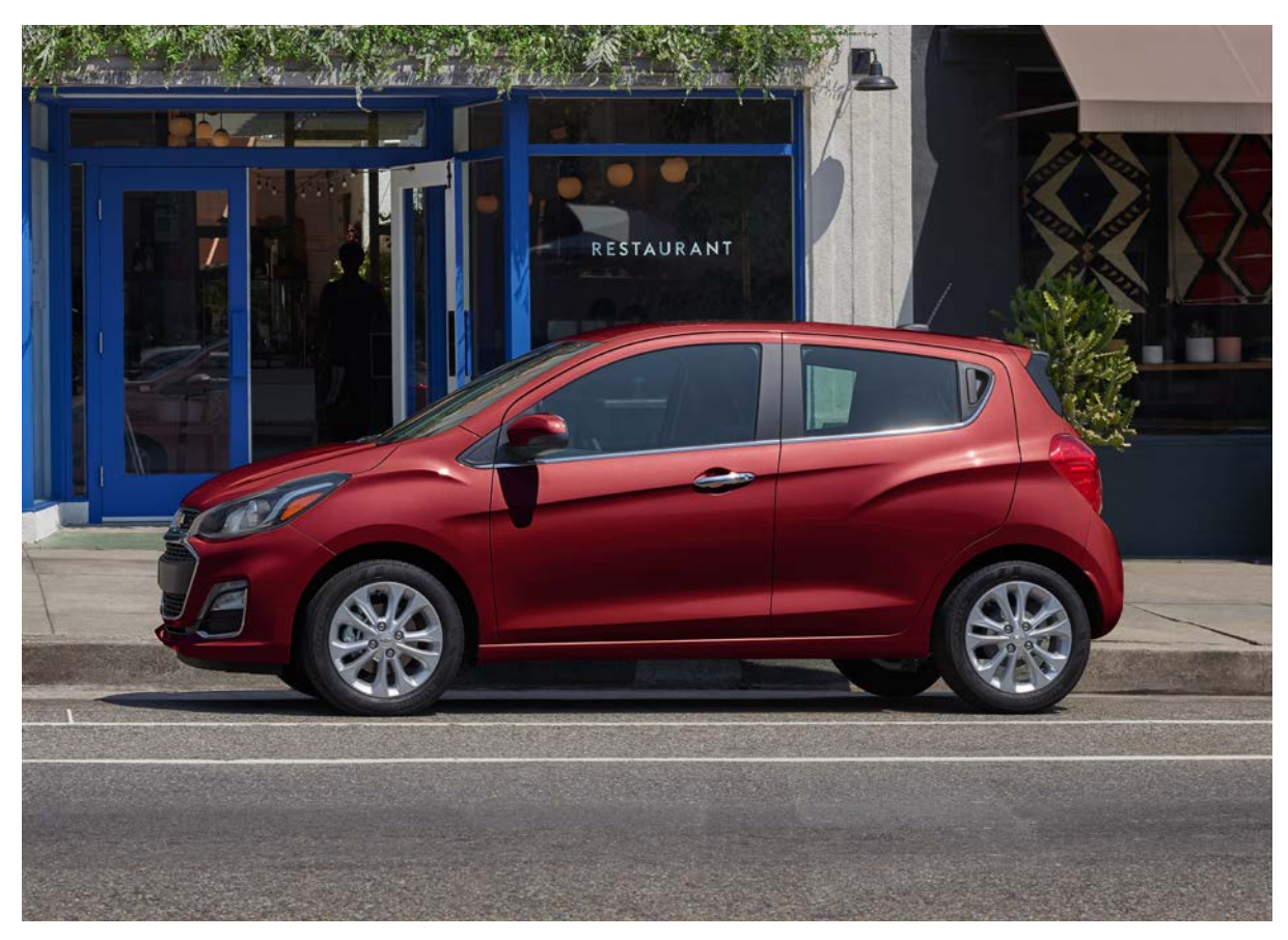
Spark 2LT in Crimson.

Going small can be the fastest way to keep up in today's world. Chevrolet Spark is not only fun to drive, but it also fits almost anywhere you want to go, with space for friends and fun. Spark offers innovative safety features and smart technologies that help keep you connected along the way. Better yet, you'll now have your pick of all those too-small-for-everybody-else parking spots.