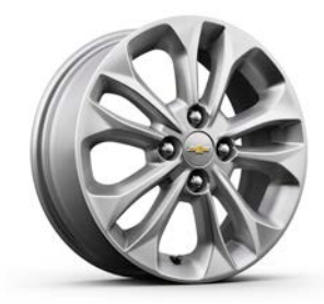
15" Silver-Painted Aluminum Wheels Standard on 2LT