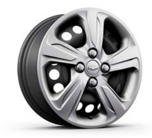
15" Steel Wheels with Painted Wheel Covers Standard on LS