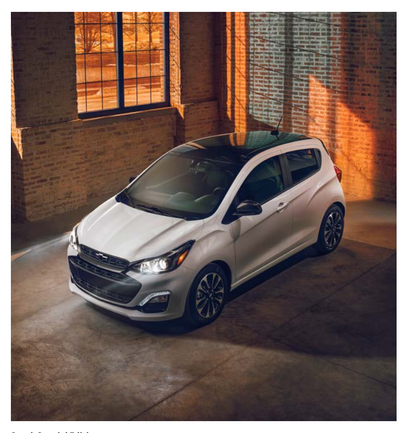
Spark Special Edition.