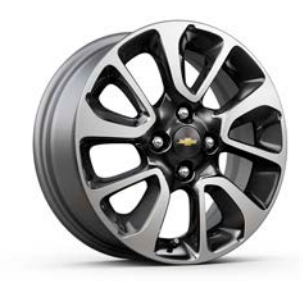
15" Gunmetal Silver-Painted Aluminum Wheels Standard on ACTIV