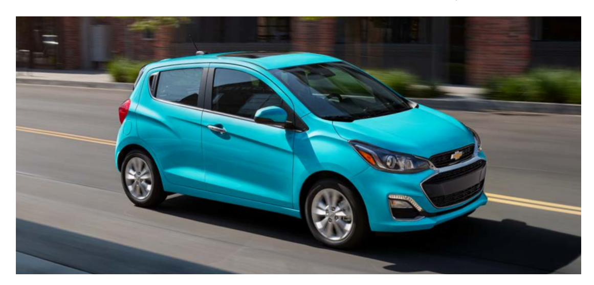
Spark 2LT in Mystic Blue (extra-cost color).