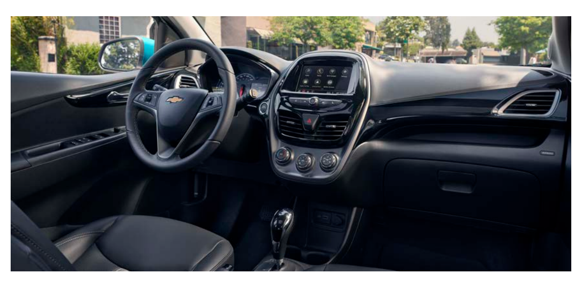
Spark 2LT interior in Jet Black.