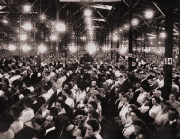
The audience listens raptly to Sunday inside the tabernacle.