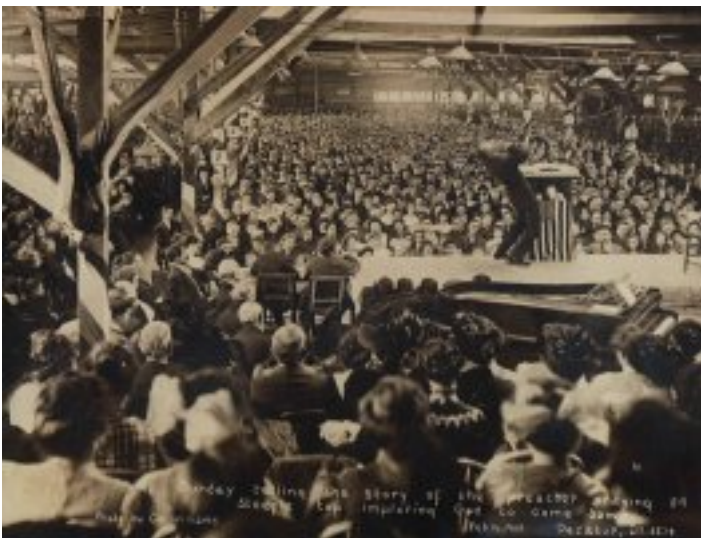
Billy Sunday speaking in Decatur, Illinois