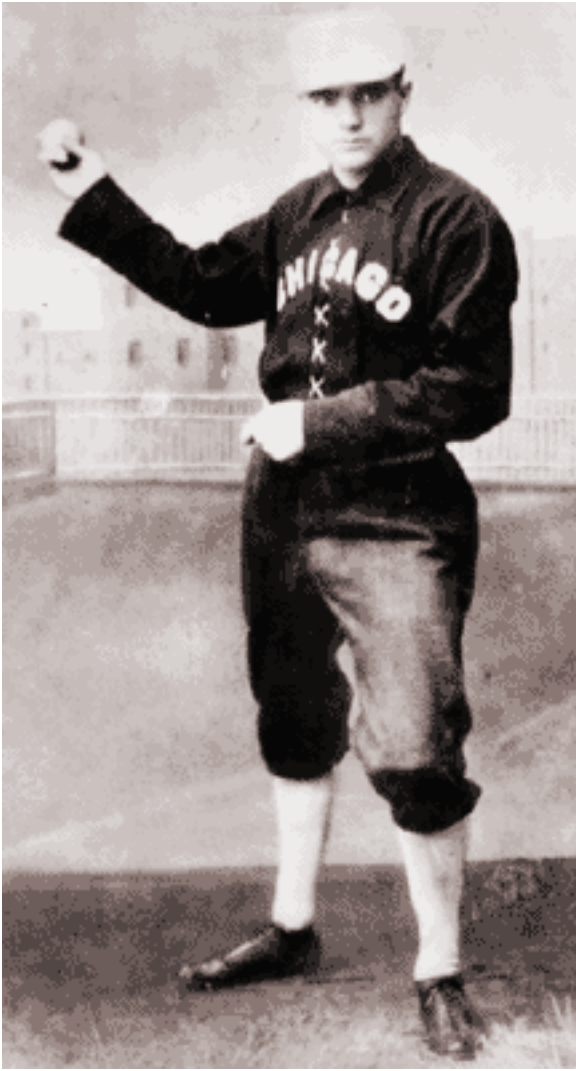
The evangelist in his days with the Chicago White Sox in the 1880s.