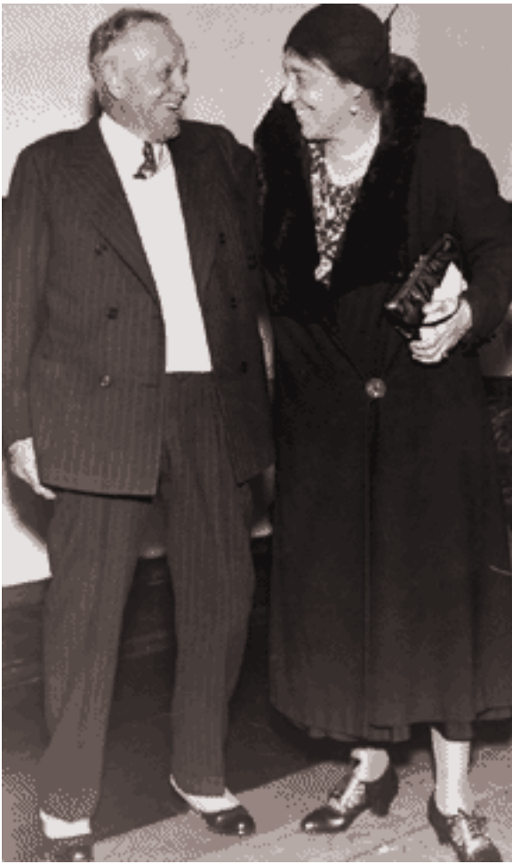
Billy Sunday and his wife, "Ma" Sunday, in 1932, three years before his death.