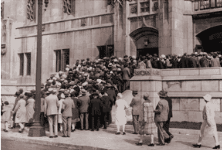
Detroiters line up outside the Masonic Temple for a Billy Sunday meeting.