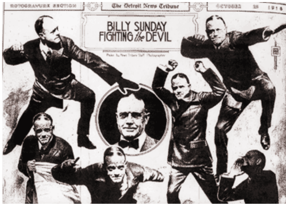
These views of Billy Sunday energetically battling the devil appeared in the Rotogravure Section of The Detroit News Tribune October 29, 1916.