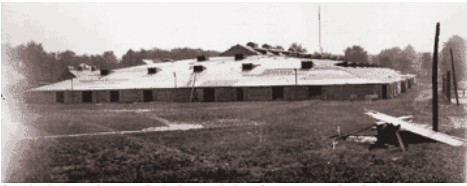
Sunday's Detroit crusade "tabernacle" under construction in 1916.