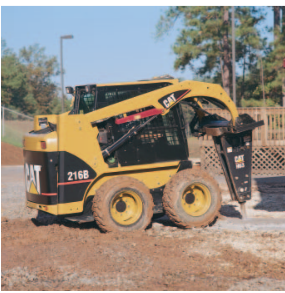
Powerful and Reliable

Auxiliary Hydraulics. Standard auxiliary hydraulics to power work tools are available through quick connect hydraulic couplings that are rigidly mounted to the loader arm. The Caterpillar line of high pressure XT<sup>TM</sup> ES hoses and O-ring face seals help assure a leak free system.