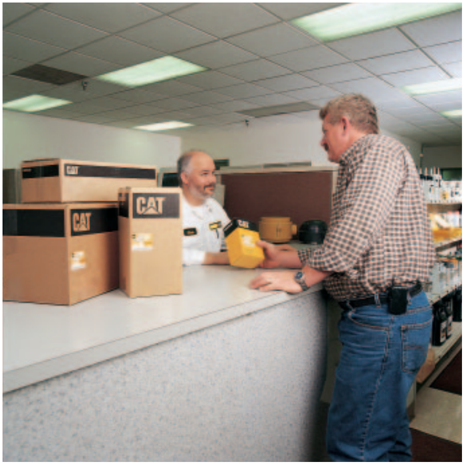
Worldwide Parts Availability

Cat dealer services help you operate longer with lower costs.