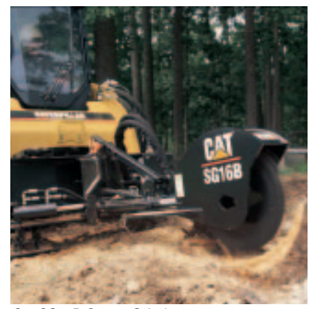
Cat SG16B Stump Grinder

An optional hydraulic quick coupler is also available and allows engagement and disengagement of work tools without the operator needing to exit the machine. Control of the coupler by use of a rocker switch inside the cab makes work tool changes quicker and easier.