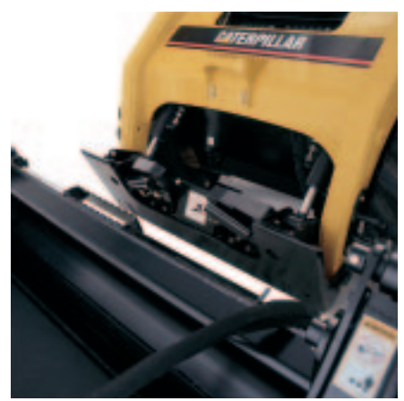
Optional Hydraulic Quick Coupler

Choose from a wide variety of tools that are performance matched to the Cat Skid Steer Loader.