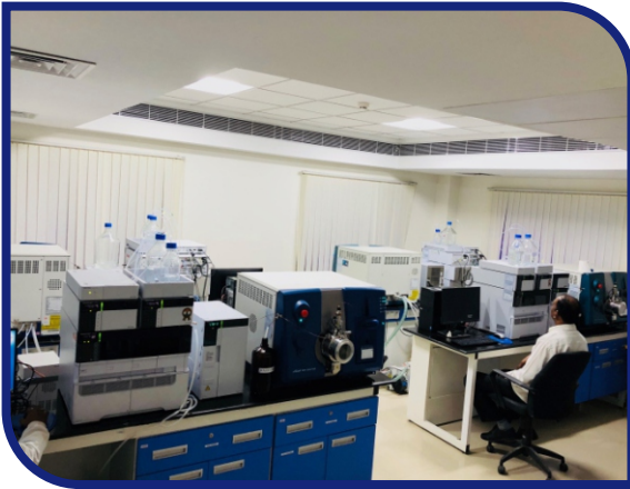
UHPLC & LC-MS/MS