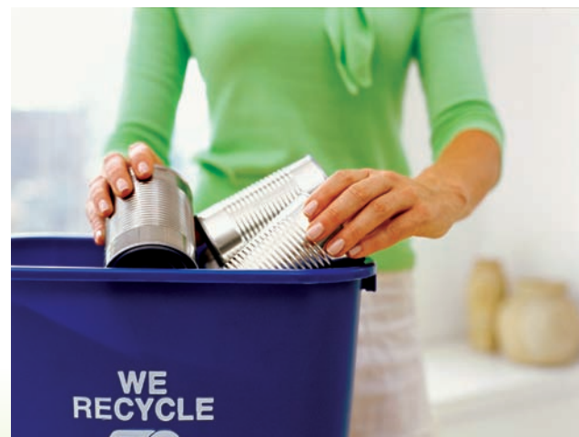
Recycling contributes to our present and future sustainability.