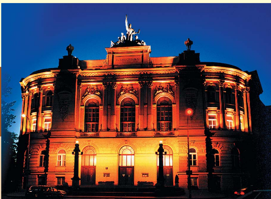
Congress Venue by night