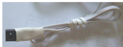
Infrared receiver interface: