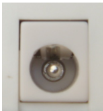
Standard DC Power input