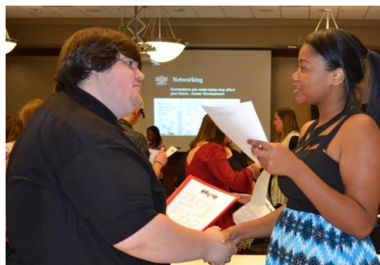
Students Develop Networking Skills