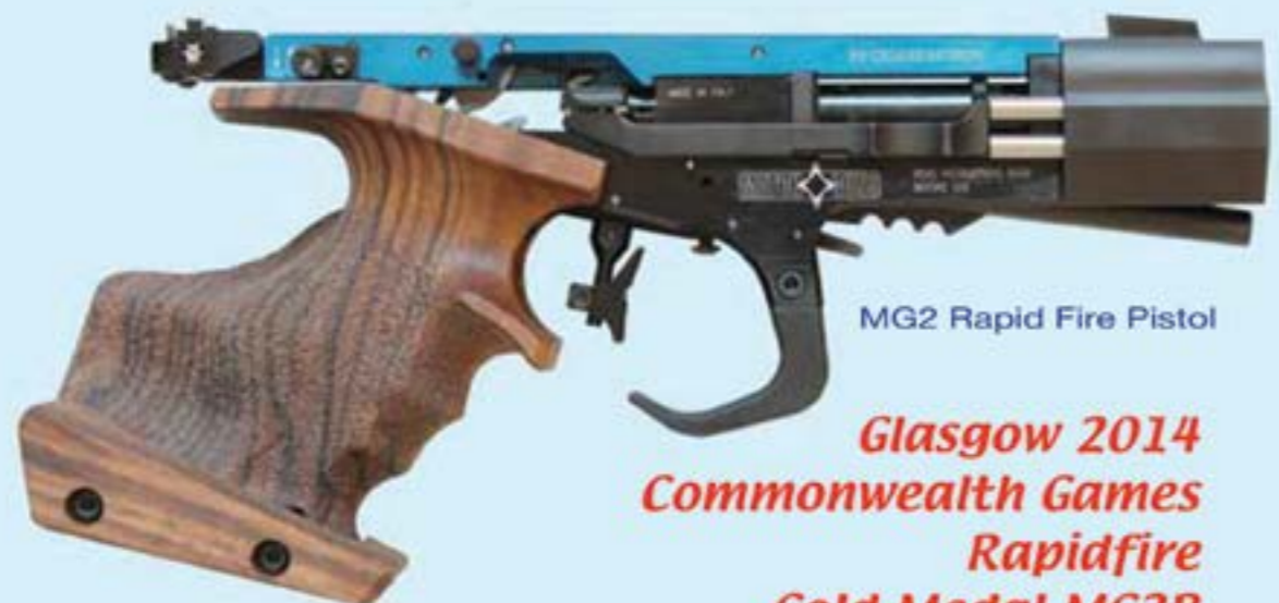
MG2 Rapid Fire Pistol

Glasgow 2014 Commonwealth Games Rapidfire Gold Medal MG2R