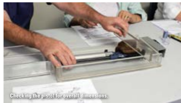
Checking the pistol for overall dimensions.

AT LAST! WIRELESS ALL MATCH SELECTION BY HANDHELD UHF REMOTE CONTROL NO MORE MESSY EXTENSION CABLES