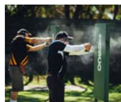
26 th Action National Championships Page 23