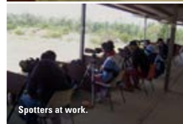
Spotters at work.