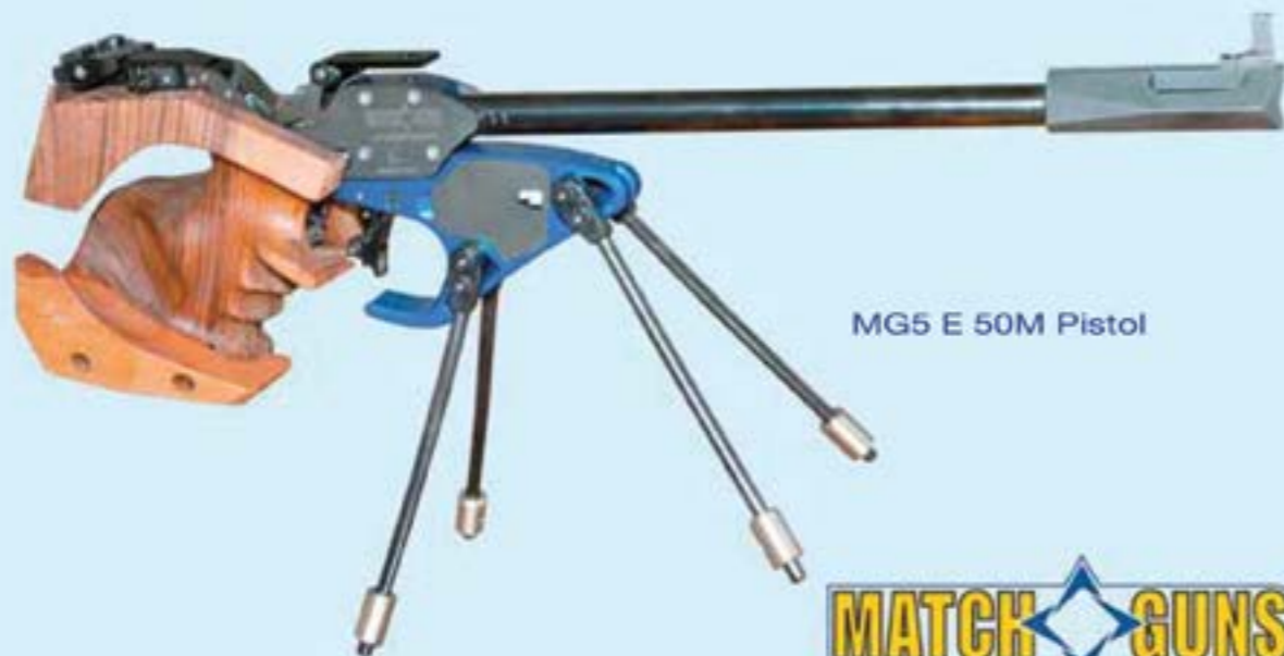
MG5 E 50M Pistol