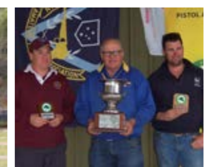
28 th Metallic Silhouette Big Bore National Championships Page 18