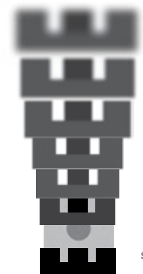
Sighting and Trigger Press Diagram

It may only take a second or two, but at this point you have a choice to continue the shot or cancel the shot. If something looks or feels wrong, then cancel the shot and start over. The setting up of the shot is most important for the learning of correct shot procedure. If you decide that it may not "feel" ok, but you then decide to "battle" through the problem, you will find that in the long term, it will become detrimental to your outcome of a good controlled shot as it becomes a "hit and miss" situation in setting up the shot.