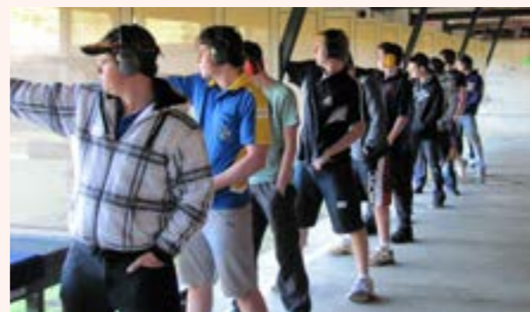
Shows the variety of postures – differences in width of feet, shoulder level, trunk rotation, and trunk lean. Arm of first shooter on the left has is almost directly in alignment with the shoulders while the angle of second shooter's arm is thirty degree angel to the shoulders.

In normal stance, if you rotate the feet slightly in placing tension on the external muscles of the hip, this further reduces this forward shift and can achieve a stiffer pelvic posture even further. The normal locking backwards of the knees and pushing forwards of the hips allows a person to stand for periods of time without using muscles to hold the posture. In pistol shooting small adjustments to this 'rest' posture can achieve greater stiffness and more control over this stance creating a more stable shooting base of support from the lower limbs and allowing less movement of the body's centre of mass.