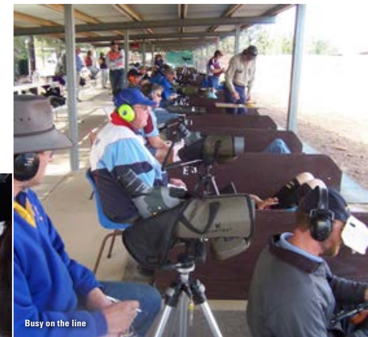
Busy on the line