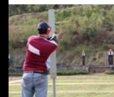
Developing WA1500 Match in Australia Page 11