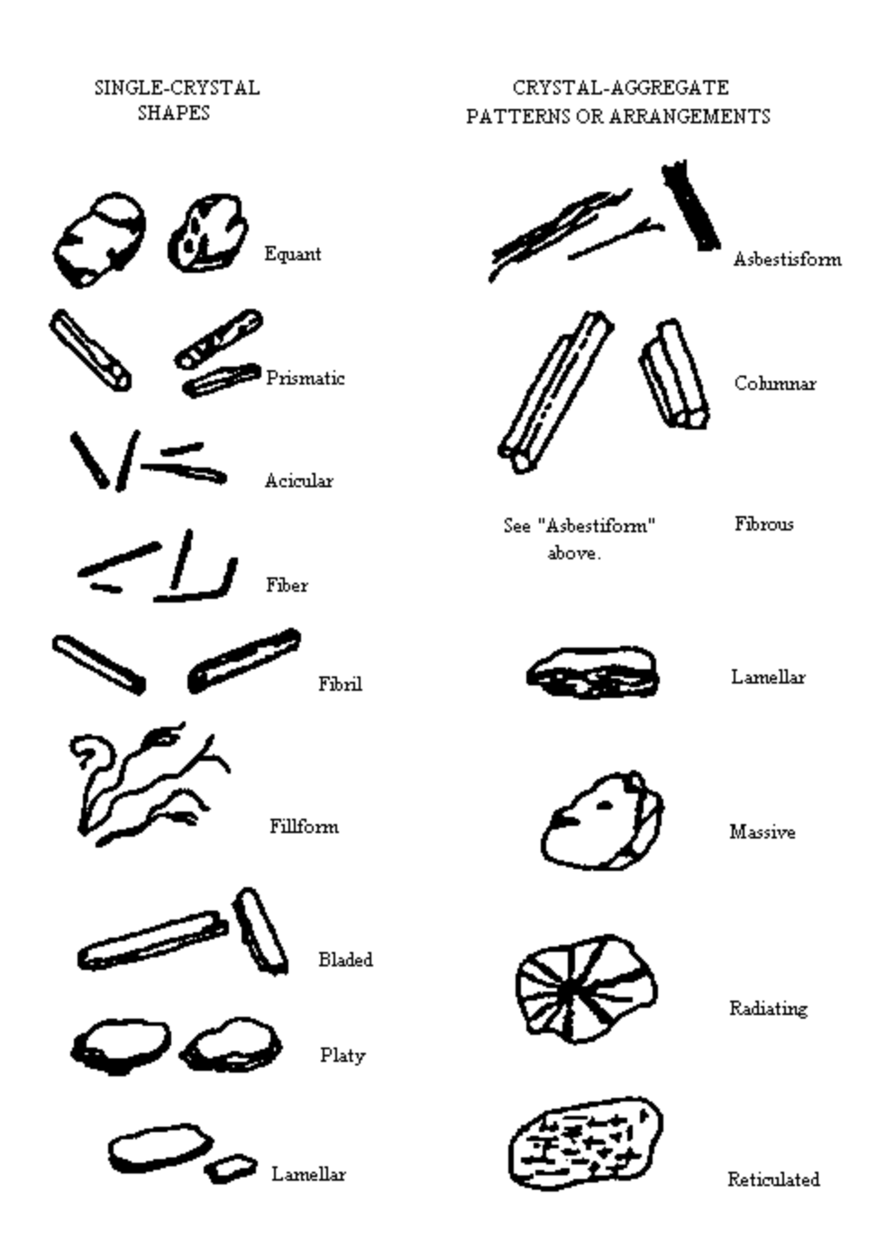
Figure 1. Particle definitions showing mineral growth habits. From the U.S. Bureau of Mines

For the purpose of regulation, the mineral must be one of the six minerals covered and must be in the asbestos growth habit. Large specimen samples of asbestos generally have the gross appearance of wood. Fibers are easily parted from it. Asbestos fibers are very long compared with their widths. The fibers have a very high tensile strength as demonstrated by bending without breaking. Asbestos fibers exist in bundles that are easily parted, show longitudinal