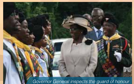
Governor General inspects the guard of honour