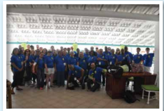
HANDS Mission Team Poses for Group Picture