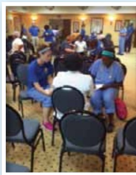
HANDS Team Doing Health Screening