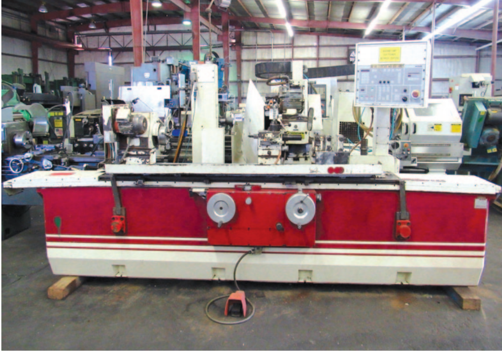
• 17" x 63" Studer S40-2 Cylindrical Grinder, 5.5" x 64" table, 20-900 rpm workhead, 1150 rpm grinding wheel, 10 hp, 2-217 ipm table speeds, work chuck, tailstock, plunge grinding, spark out