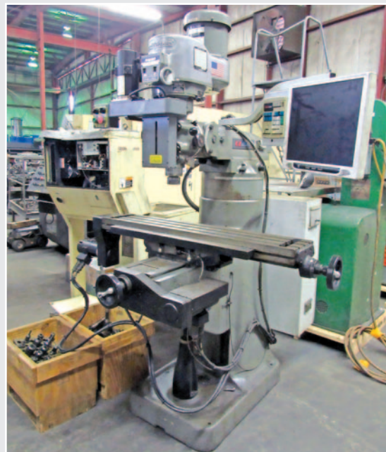
• Bridgeport EZ Trak Series I CNC Vertical Milling Machine, 9"x48" table, 4200 rpm, 2 hp, EZ Trak CNC