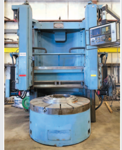
• 76" Bullard 4-Axis CNC VBM, 76" (4-jaw), 88" swing, 72" under rail, GE Fanuc Series 15-TT, gov. surplus