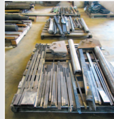
• Large Assortment of Tooling