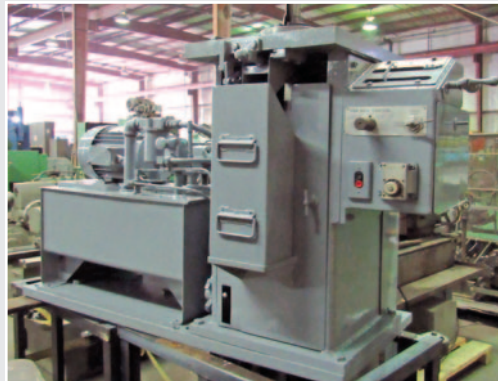
• Mitts & Merrill 3-AHFRD-KS Keyseater , 24" max. length, 1/8" - 2" width, 3-3/8" std post, 7.5 hp motor, T-slotted table