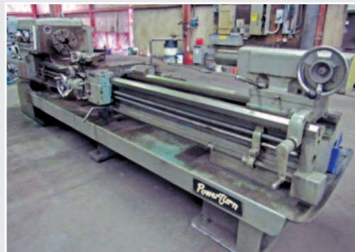
• 20"/13" x 102" Lodge & Shipley 2013 Powerturn Engine Lathe , 21-1740 rpm, 2-1/16" bore, inch threads, 12" 4-jaw chuck, tailstock, taper, coolant