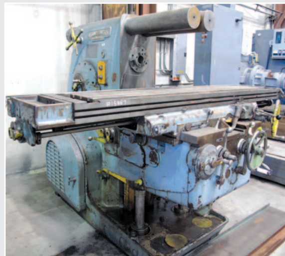
• Kearney & Trecker 425TF Plain Horizontal Mill, 88" x 17" tbl, 13-300 rpm, 25 hp, No. 50 taper, double overarm