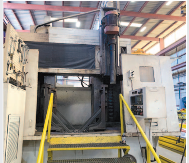
• Springfield 48 CNC High Column CNC I.D / O.D. Vertical Grinder, 48" dia. table, 72" swing, 72" under rail, 5-100 rpm, 10 hp, GE Fanuc 15-T CNC, wheel dresser, coolant