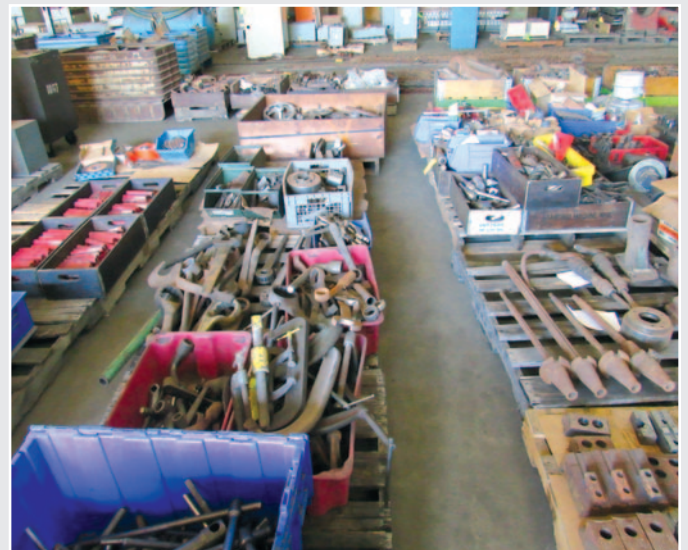
• Tooling, Thousands available