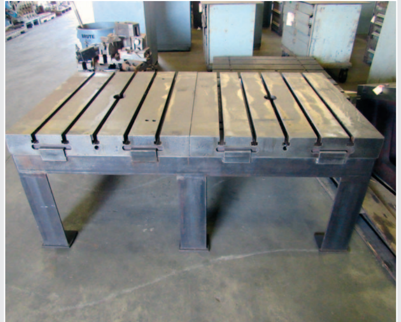
• T-Slotted Tables, (2) 36" x 36" T-Slotted tables on steel base, 27" high