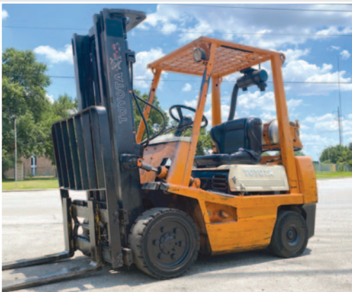
• 4,700 Lb. Toyota Model 42-4FGC25 Forklift