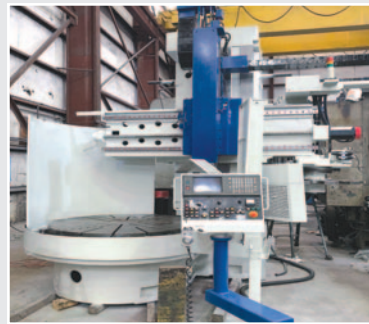
• 59" Toshiba TUE-15 Hi-Column CNC VBM