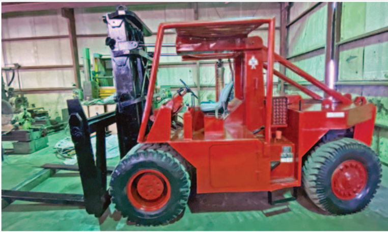
• 45,000 Lb. Taylor Model Y-45-WOS Forklift

Inspection: Monday, July 13, 9:00am to 3:00pm CDT • 3609 Clinton Dr., Houston, TX 77020