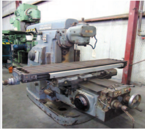
• Cincinnati Milacron 315-16 Plain Dial Type Horiz. Mill, 16" x 72" table, 16-1600 rpm, 15 hp, #50 NS taper, Newall 2-axis DRO