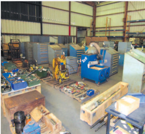
• Lots and lots of tooling to choose from