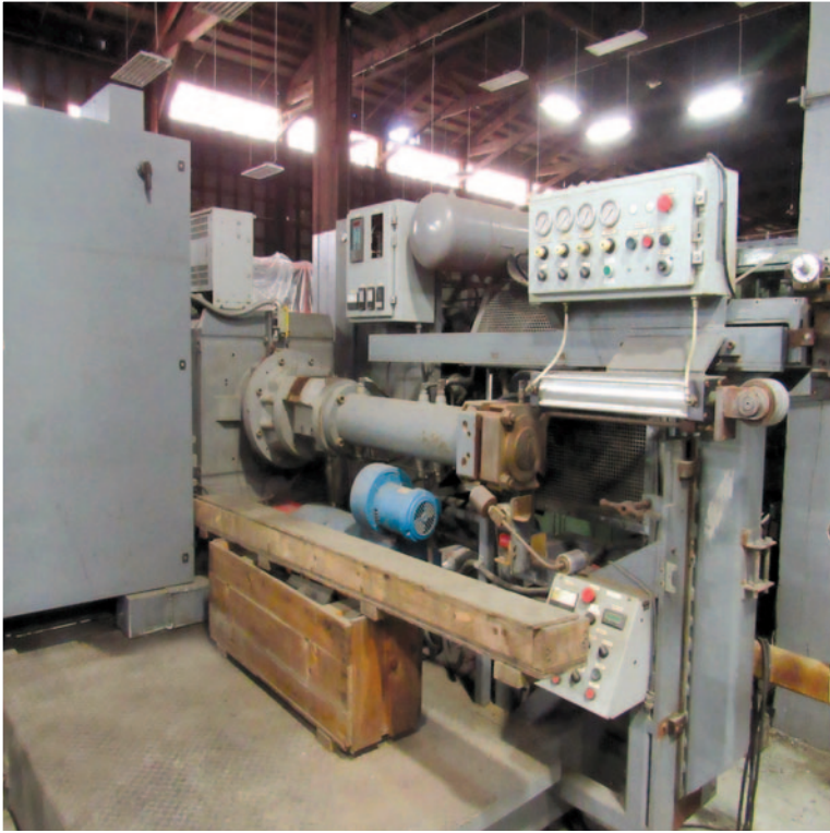
• NRM Extrusion Extruder , 1997, 3.5" size, L/D: 12:1, 75 hp, air cooled, 300 psig, single screw type, mounted on var. speed travel car, 3 temp. zones