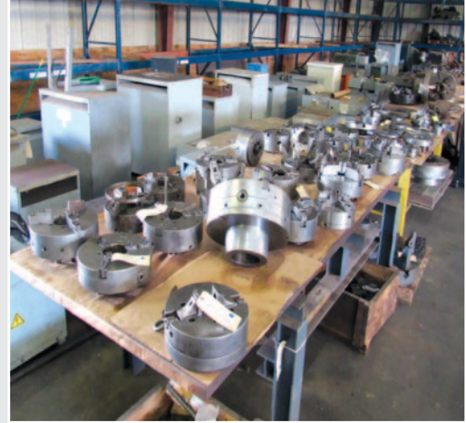
• Hundreds of Chucks of all Sizes Available