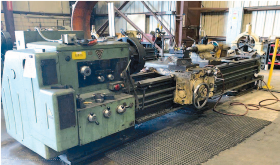
• 26" x 120" Ryazan Engine Lathe, 26" swing, 14" over cross slide, 120" centers, 10 - 1250 rpm, 27hp, 3-3/8" spindle bore, 20" 4-jaw chuck, inch/metric threads, tailstock, taper attach., steady rest, 4-way tool post, chuck guard, coolant