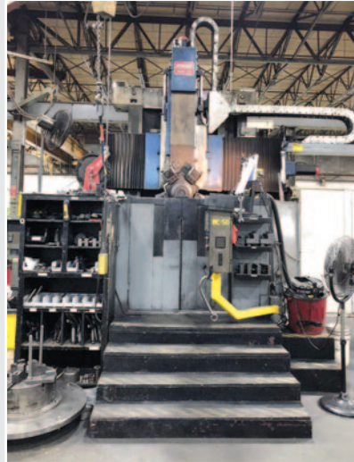
• Monarch VLN 12 CNC VTL, 47" tbl, 61" swing, 55.7" max. part ht, 3.3-280 rpm, 50 hp, Fanuc 18i-T CNC