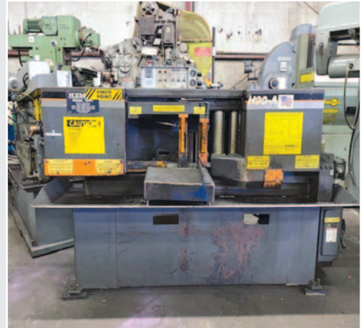
• HEM H90 A-B/F Auto Horiz. Bandsaw, 1999, 12.75" x 12.75" cap., 60 - 300 fpm, 3 hp, 0" - 24" feed stroke