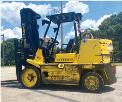
• 15,000 Lb. Hyster Model S155XL2 Forklift