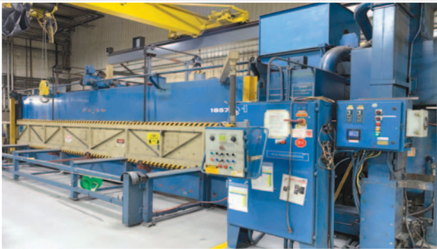
• Pangborn Rotor Blast Machine , for Downhole Mud Rotors, 1991, 5" max. dia., 20' 8" max. length, 0-12 rpm rot. speed, 36" high x 24" long door, dust collector, head and tailstock on work cart, prog. blast nozzle, pressure pot