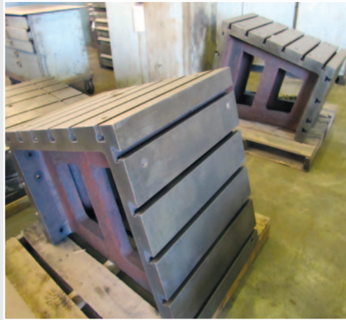
• Lot of (2) T-slotted Angle Plates , 24" wide with (3) T-slotted faces 36" / 30" 22" in length)