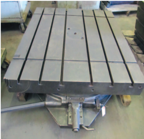
• 48" x 48" x 5.5" T-slotted Hyd. Rotary Table