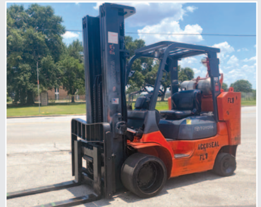
• 10,000 Lb. Toyota Model 7FGCU45-BSC Forklift