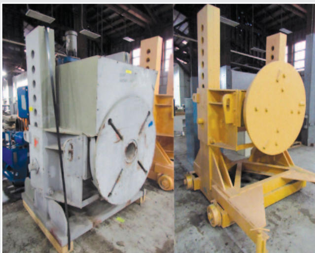
• 24,000 Lb. Ransome 7-H / 7-T Positioner, 46" table dia., 12" G.C., 12" ecc., 7.5 hp