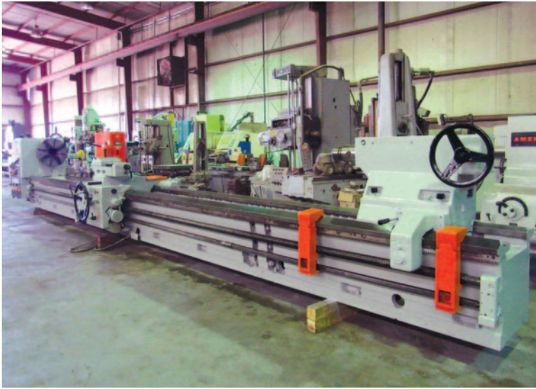
• 41" x 314" Sigma Tos SU-100 Engine Lathe, 2.2-450 rpm, 4.1" spindle bore, inch/metric threads, 24" 3-jaw chuck, 40" 4-jaw chuck, Aloris tool post, (3) steady rests, tailstock, taper attach.