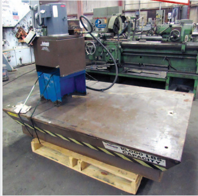
• Autoquip 18,000 Lb. Hyd. Lift Table , 52" x 70" table, 14" lowered ht., 36" lift stroke, 5 hp hyd. power pac, up/down push button controls