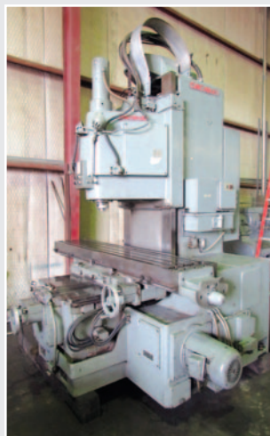
• Cincinnati 550-20 Vercipower Vert. Mill, 20" x 94.5" table, 14-1400 rpm, 50 hp, 50 taper