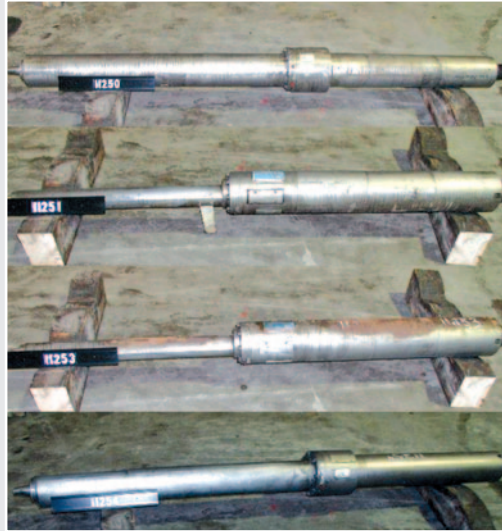
• Setco Grinding Spindles, Five to choose from, 77"-92" lengths, 4"-6" dia.