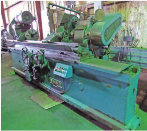
• 17" x 72" HD Cincinnati Plain Cyl. Grinder, 17" swing, 72" ctrs, 36"x3" grinding wheel, 20 hp, 15" 4-jaw chuck, tailstock, work rests, coolant/hyd. syst.