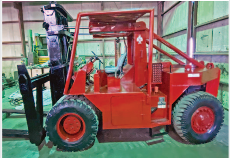
• 45,000 Lb. Taylor Model Y-45-WOS Forklift