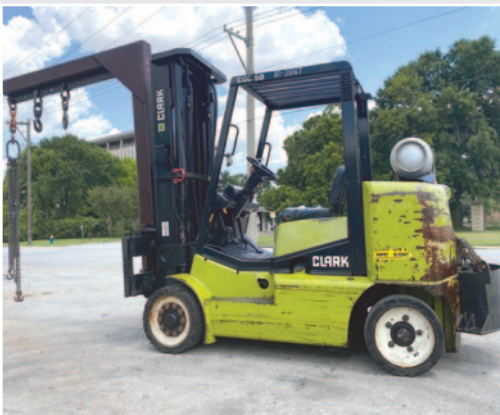
• 10,000 Lb. Clark Model CGC50 Forklift