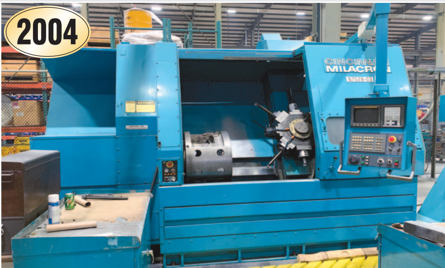
• Cincinnati Milacron Cinturn 28C CNC Valve Chucker Lathe, retrofit 2004, 50" swing over bed, 900 rpm, 50 hp, 10" bore, 28" O.D. 4-pos. valve indexing chuck, Fanuc Oi-TB CNC