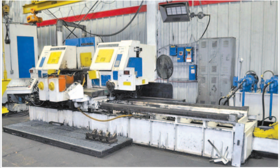
• Seneca Falls MC 150 Facing/Centering Machine, 0.75"-12" OD cap., 40" swing, 120" ctrs, (2) 20 hp mtrs, 294-1256 rpm drill, 78-333 rpm mill, dual oper. cntrls, coolant