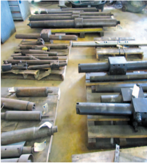
• Dozens of assorted size boring bars available

Inspection: Monday, July 13, 9:00am to 3:00pm CDT • 3609 Clinton Dr., Houston, TX 77020