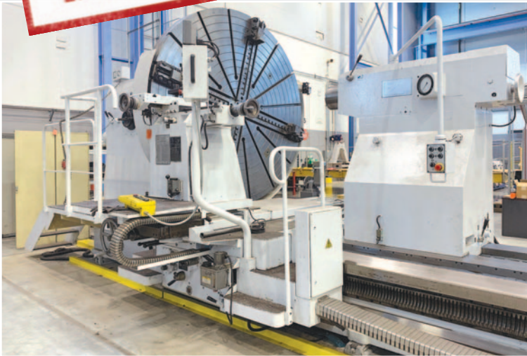
• 122" x 240" Poreba TCS 305-3/3 X 5M HD Lathe, New 1999, 0.5-100 rpm, 100 hp, 110" 4-jaw chuck, threading, motorized tailstock, 3 axis DRO

100,000 SQ.FT. LEASE LOST – Complete Site Sale to Include: All Machine Tools, Equipment, Rolling Stock, Tooling, Accessories, Shop Support, Cabinets, Electrical Supplies, Tool Room Equipment, (100+) Vidmar Cabinets & Much More!