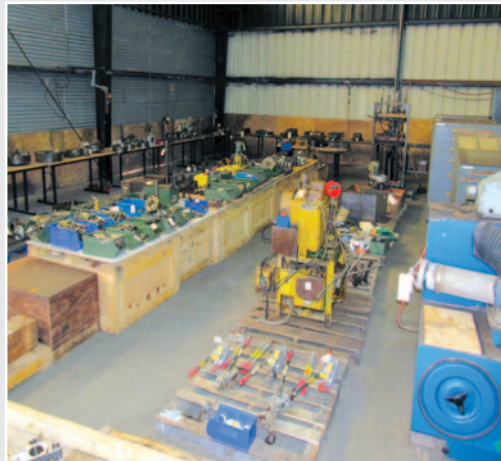
• More tooling!