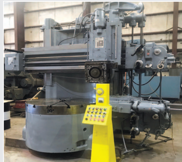
• 54" Bullard VTL, 54" table (4-jaw), 58" swing, 44" under rail, 2.2-160 rpm, 30 hp, side head, new electrics 1992, new PLC unit 2018