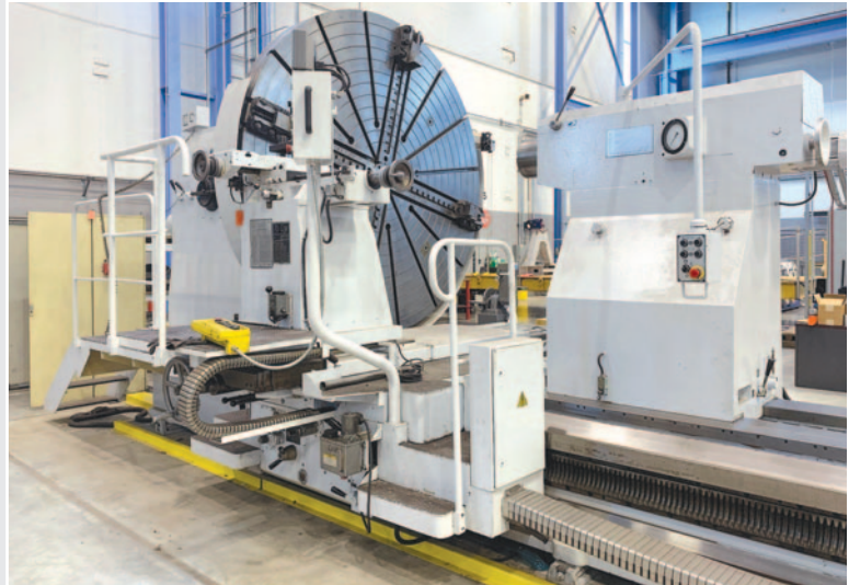
• 122" x 240" Poreba TCS 305-3/3 X 5M HD Lathe, New 1999, 0.5-100 rpm, 100 hp, 110" 4-jaw chuck, threading, motorized tailstock, 3 axis DRO