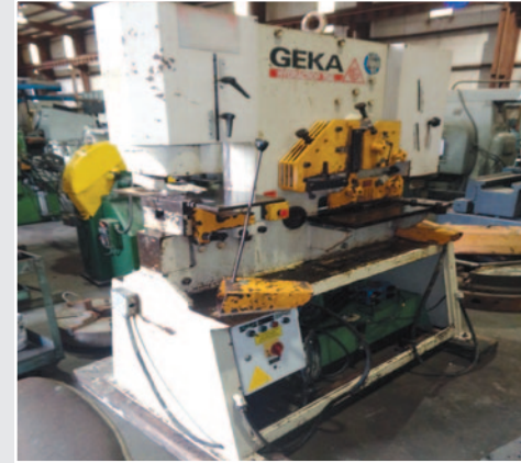
• 70 Ton Geka-Hydracrop HYD-70 Ironworker , angle cut-off, flat, round, square, punch, 3" stroke, 20" throat