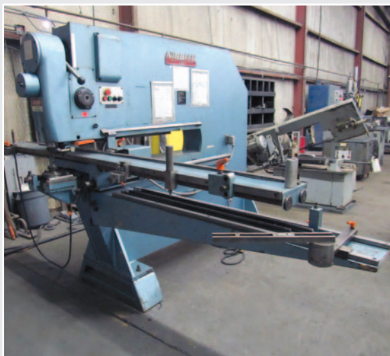
• Fabriks Faximil 6CCN 1000 Nibbler, 250-1400 spm, 2-8 mm adj. stroke, 1330 mm projection, 1.5 kW