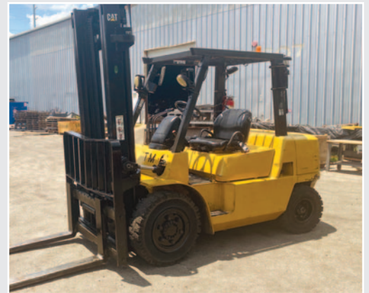
• 8,000 Lb. CAT Model DP40KL Forklift