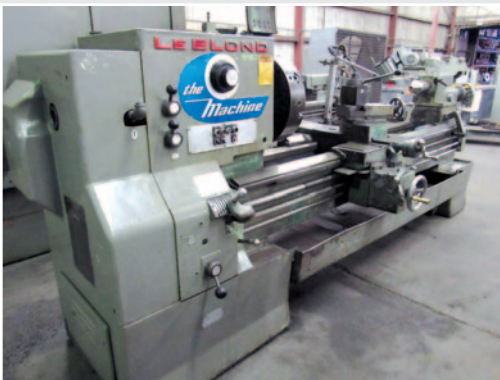
• 26" x 68" LeBlond The Machine™ Engine Lathe , 14-1080 rpm, 2-1/8" bore, inch threads, 18" 4-jaw chuck, taper, tailstock, coolant