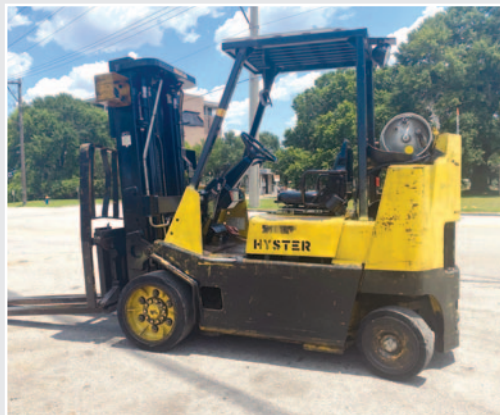
• 8,000 lb. Hyster Model S80XLBCS Forklift