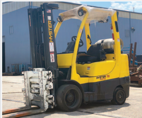
• 5,000 Lb. Hyster Model S70FT Forklift