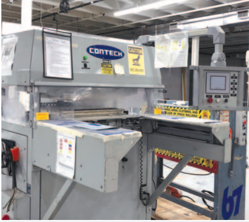
• Contech UP2028 Shuttle Bed Die Cutting Press, with Hydraulic Unit