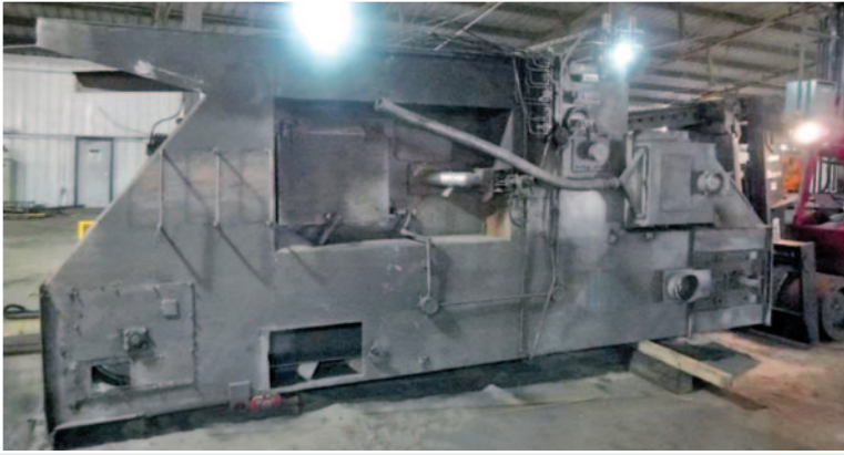
• Pangborn Pass Through O.D. Pipe Blasting Unit , blast unit, hopper, (2) pipe rollers /handlers, motor, hydraulic ram, ducting & dryer