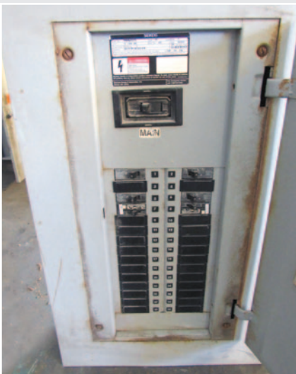
• AMP Siemens Type S3 Circuit Breaker Box, Dozens to choose from, 15 KVA to 225 KVA