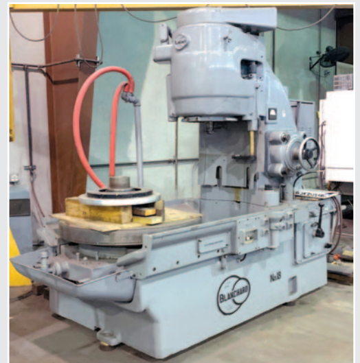
• 36" Blanchard 18-36 Rotary Surface Grinder, 36" mag. chuck, 40" swing, 6-33 rpm chuck, 18" grinding wheel, 720 rpm wheel, 40 hp, updated controls, neutrifier, machine record. 2018