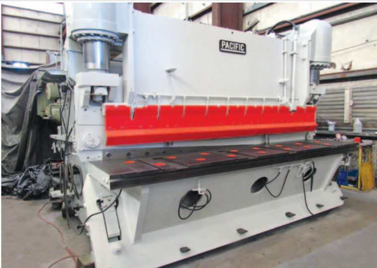
• 10' x 1" Pacific 750-S10A Hydraulic Power Squaring Shear, 124" knives length, 18" throat, 40 hp, adj. rake, squaring arm