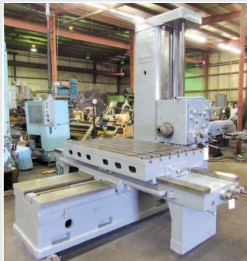
• 4" Wotan B100L Table Type HBM, 4" spindle, 40" x 68" table, 70.8" cross trvl, 39.3" long. trvl, 49.2" headstock vert. trvl, 14-1600 rpm, 4-axis Newall DRO