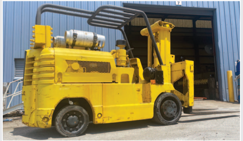
• 20,000 Lb. Yale Model L5-200-FAS-G Forklift