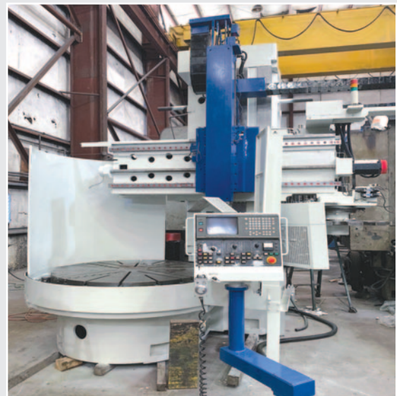
• 59" Toshiba TUE-15 Hi-Column CNC VBM, 70.8" max. dia., 59" max. height, 2-250 rpm, 60 hp, ATC, Fanuc 18T CNC