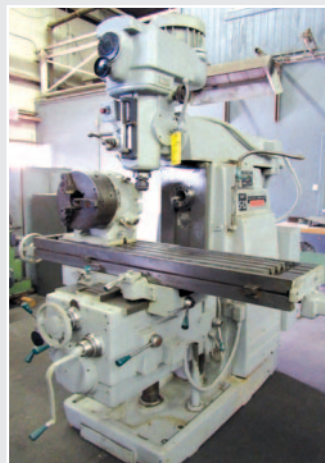
• Kearney & Trecker Milwaukee 205 S-12 Horiz. Mill, 12" x 56" table, 25-2000 rpm, 5 hp, No. 50 taper, 12" 3-jaw rot. tbl