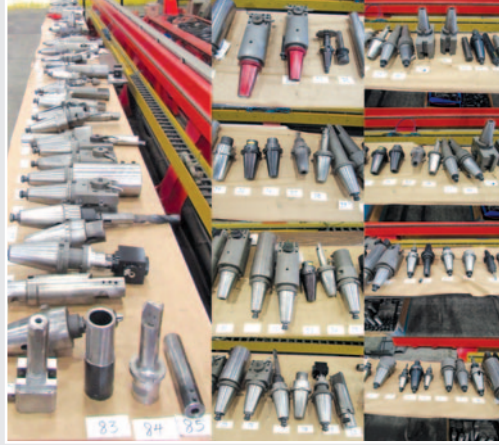
• CAT 60 Tooling, Sandvik Coromant, G&L Davis, Kennametal, Parlec and more (Over 100 Pieces Available)