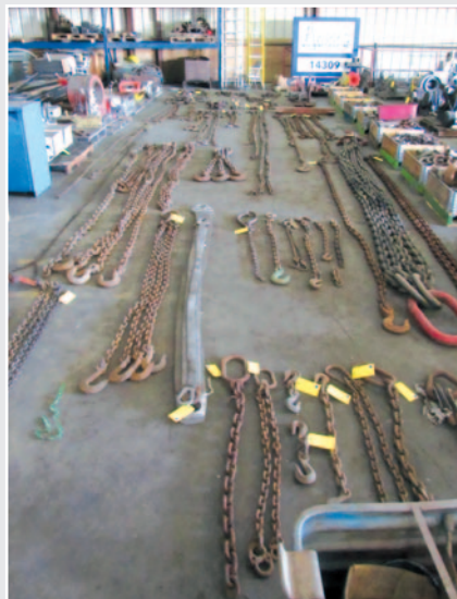
• Rigging Chains, Assorted lengths available