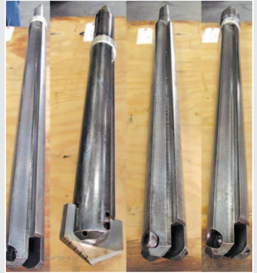
• Hundreds of Drill Bits and Other Tooling Available