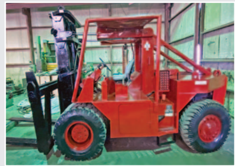
• 45,000 Lb. Taylor Forklift