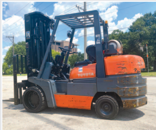
• 10,000 Lb. Toyota Model 52.6FGCU45 Forklift