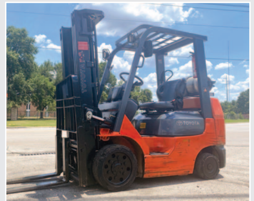
• 5,000 Lb. Toyota Model 42-4FGC25 Forklift