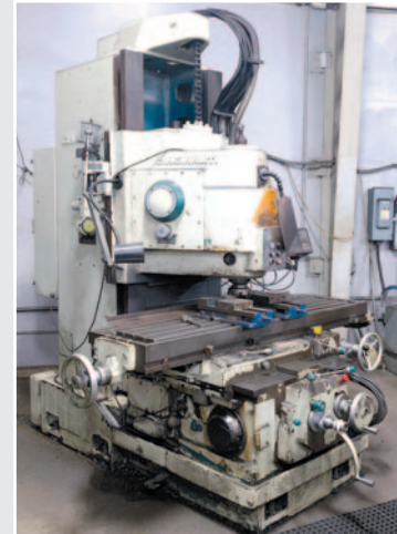
• Cincinnati Vercipower Vert. Mill, 18" x 72" table, 16-1600 rpm, 20 hp, 50 taper