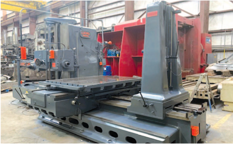
• 5" Lucas 542B-60 HBM, 5" spindle, Morse #7, 48" x 62" table, 9 - 1200 rpm, 20 hp, tailstock, Newall DRO's