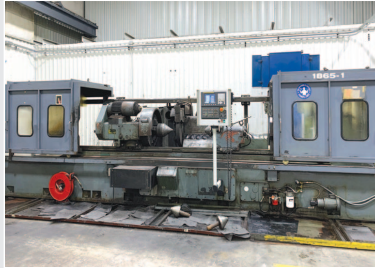
• 24" x 120" TOS-Hostivar BUT 63-3000 CNC Cylindrical Grinder, 2-200 ipm table speeds, 935 rpm grinding wheel, 25 hp, 9-57 rpm work head speeds, 10 hp, Fanuc Oi-MATE-TD