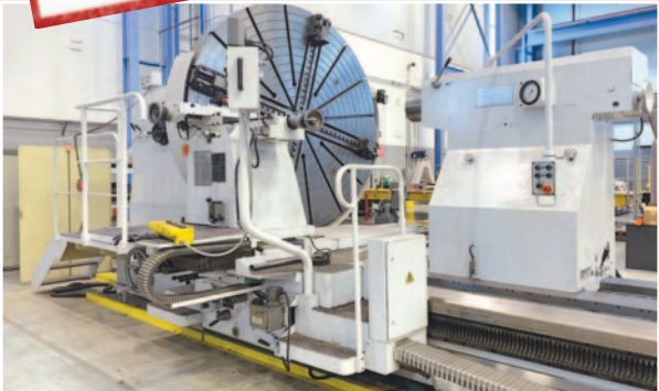
• 122" x 240" Poreba TCS 305-3/3 X 5M HD Lathe

100,000 SQ.FT. LEASE LOST – Complete Site Sale to Include: All Machine Tools, Equipment, Rolling Stock, Tooling, Accessories, Shop Support, Cabinets, Electrical Supplies, Tool Room Equipment, (100+) Vidmar Cabinets and Much More!