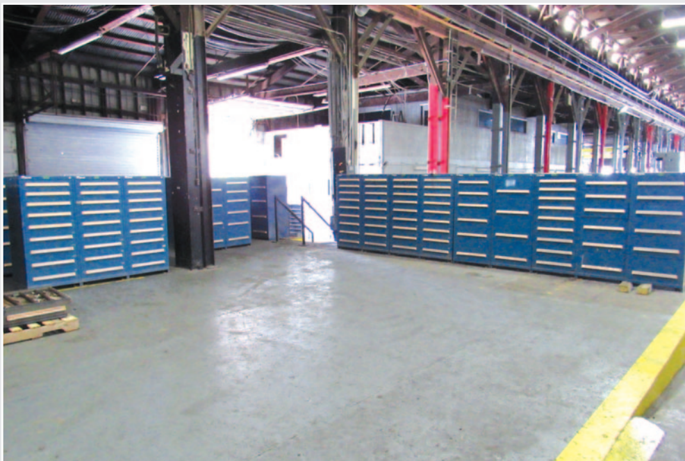
• Vidmar Cabinets, Lots to Choose From – Great Condition

Inspection: Monday, July 13, 9:00am to 3:00pm CDT • 3609 Clinton Dr., Houston, TX 77020