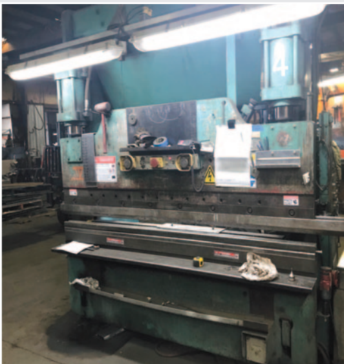
• 6' x 90 Ton Cincinnati 90CB Hyd. Press Brake, 90 tons, 72" die, 78-1/2" btwn housings, 8" stroke, 15" open ht, 7" throat, 15 hp, dual palm control, 4-way die