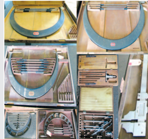
• Starrett and other QC Tooling