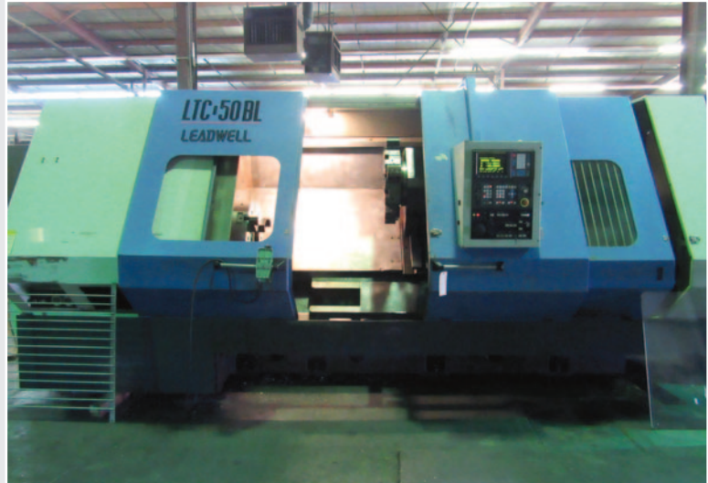
• Leadwell LTC-50 BL CNC Lathe, 1998, 33" swing, 80" centers, 1500 rpm, 4" bore, 24" 3-jaw SMW chuck, Fanuc O-T CNC, 5690 cutting hrs., inspection report available