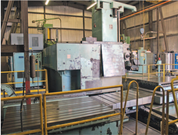
• 7" Giddings & Lewis MC-70 Twin Pallet CNC HMC, 7" spindle, 144" X / 103" Y / 60" Z / 118" W, 12-2200 rpm, 107 hp, (2) 60" x 96" pallets, Numeripath 8000B CNC