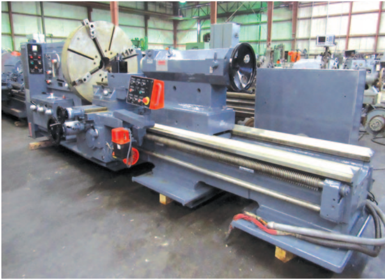
• 45" x 78" Poreba TR-115B2/78 Engine Lathe, New 1998, 4.75" spindle bore, A1-15 nose, 5-500 rpm, inch/metric threads, 42" 4-jaw chuck, steady rest, tailstock, taper attach., Newall DRO