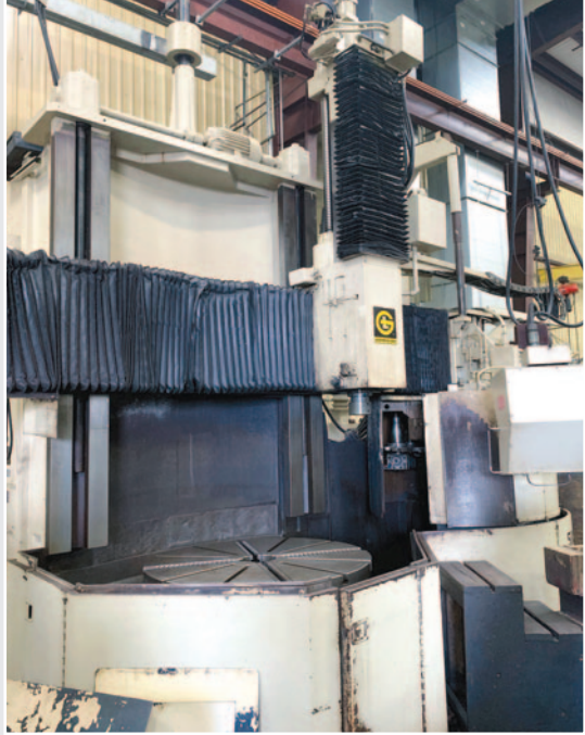
• 48" Giddings & Lewis VTC48 CNC VTC, 60" swing, 72" under rail, 4-320 rpm, 60 hp, tool changer, tool turning/boring tool holders, FOR RETROFIT