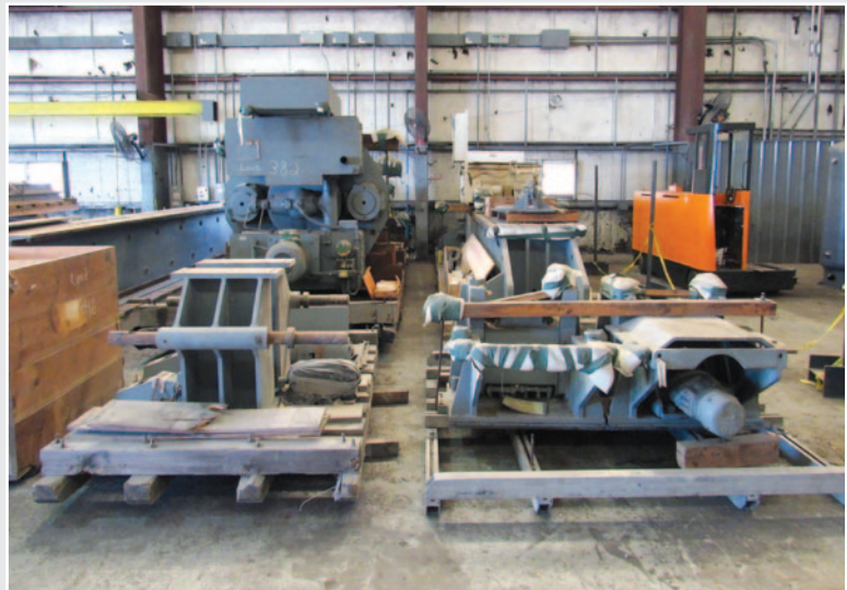
• 1000 Ton Verson Allsteel 1000-HD1-ST Traveling Gantry Straightening Press, 30' x 36" bed size, 40" btwn col., 24" stroke, 30" shut height, on U.S. government skids