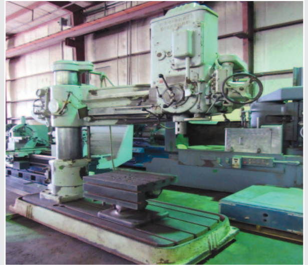
• 4' 13" Cincinnati Bickford Super Service Radial Drill, 48" arm, 13" col., 60" under arm, 21 - 2300 rpm, 10 hp, #5 Morse, 4" spindle dia., 18" spindle travel, tilt box tbl, pwr elev., pwr clamp, rapids, coolant