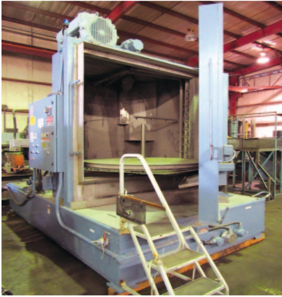
• 60" Proceco Typhoon-HD Table Type Parts Washer, 60" dia. x 60" ht. max. work piece, 2500 lb. load cap., (2) recirc. stages, 140-180 F