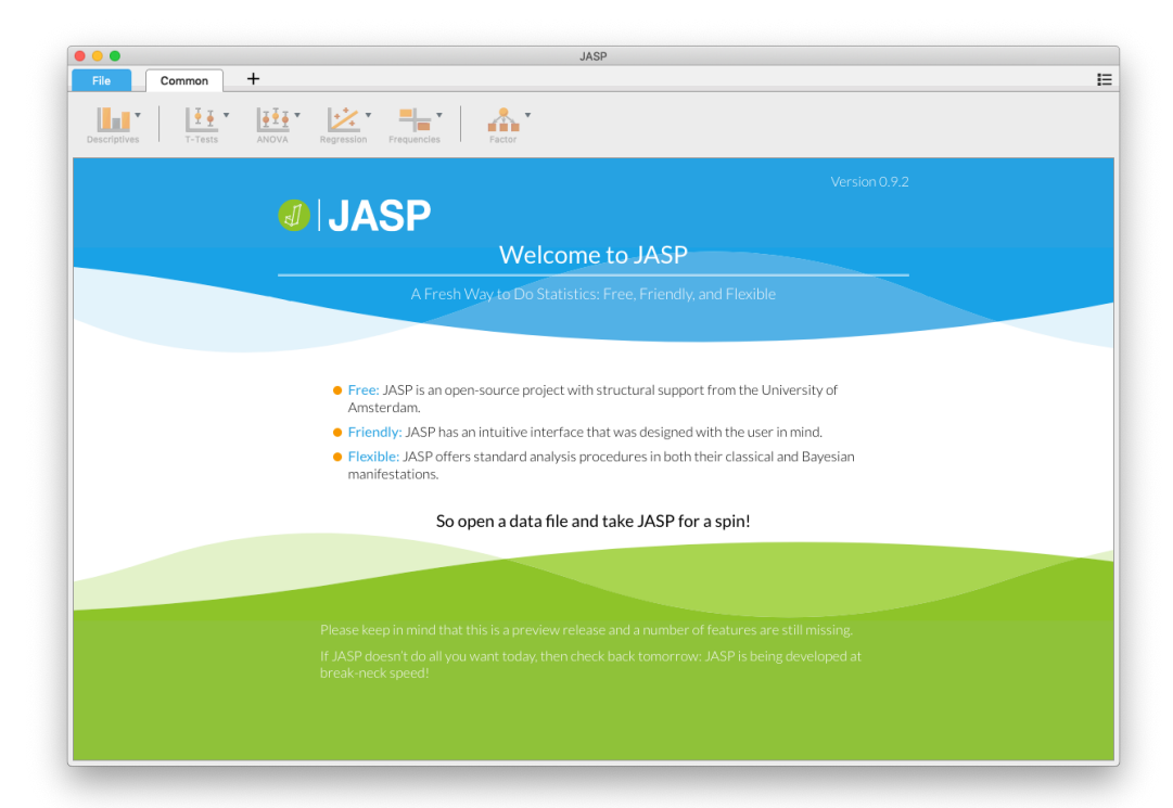
Figure 3.1: JASP looks like this when you start it.

developers; their philosophy is that users should be allowed to use the editor they are most comfortable with <sup>4</sup>. Thus, the preferred method for getting data into JASP is to load a CSV file (.csv), which is a text-based data format that can be created by (and opened in) any spreadsheet program. More details about this will be given shortly.